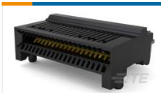
TE Part #1551920-2 zQSFP+ connector assembly