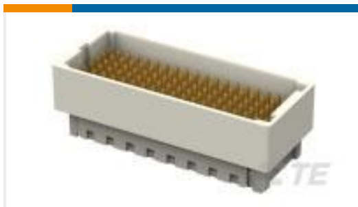
TE Part #2102060-1 Mezalok, Pin, 114 p, 50 Au, TL