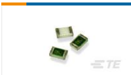
TE Part #1879213-5 CPF 0402 28R7 0.1% 25PPM 1K RL