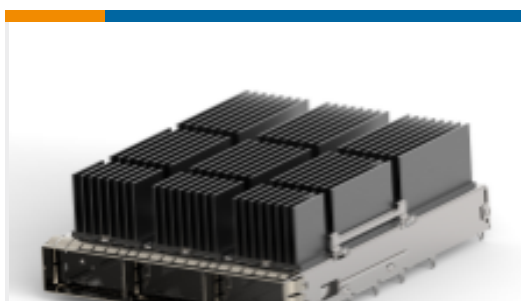
TE Part #2342886-3 CAGE ASSY 1X3 QSFP-DD HS EXTRUSION NET