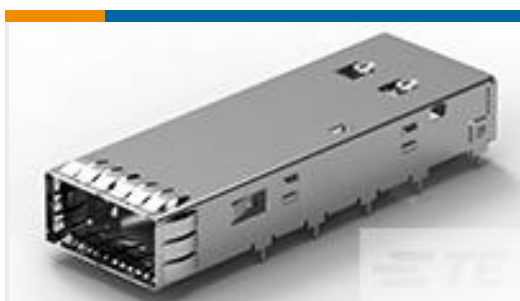
TE Part #2110487-1 QSFP Cage, Solder Leg, No HS Opening