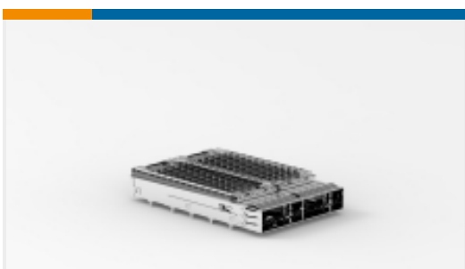
TE Part #2170806-4 CAGE ASSEMBLY, 1X2, QSFP28, SPRING, HS