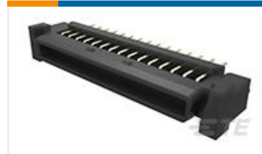
TE Part #5176374-2 AMP FH CONN REC V 60P (H=14)