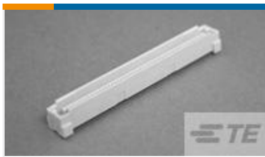
TE Part #1-5084615-0 0.8FH,P06H.5,200,30/Sn,TU