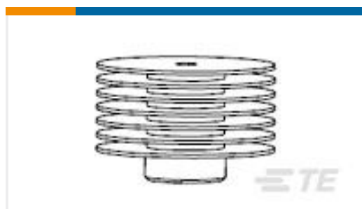
TE Part #7-1542006-8 HTS804-U=29MM HS ASSY ULTEM CL