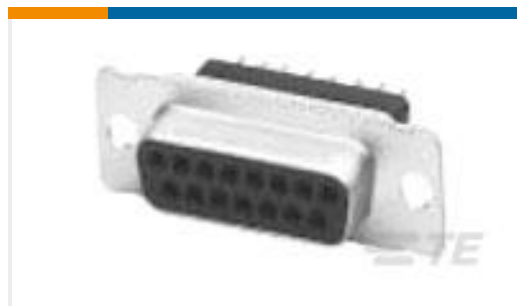
TE Part #205736-4 15 RCPT SP/MS STD