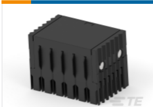
TE Part #2018849-1 ASSY, SEATING TL, 6 ROW, 6 COL