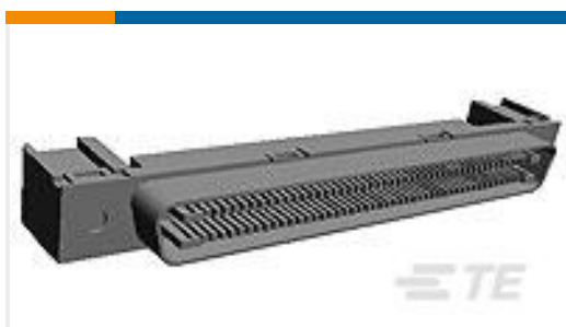
TE Part #5787885-1 200 CMP DCK RA PLG INV SHL 3.4