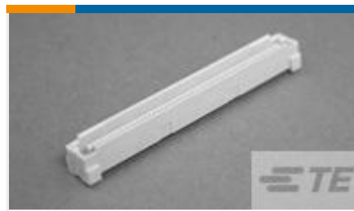
TE Part #5084615-2 0.8FH,P06H.5,060,30/Sn,TU