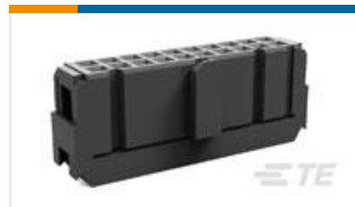
TE Part #1658621-9 40 NOVO MIL/CTR 15DP, LEAD FREE