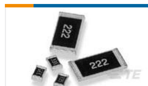
TE Part #8-1879501-0 CRGH2512 5% 2K0 2W