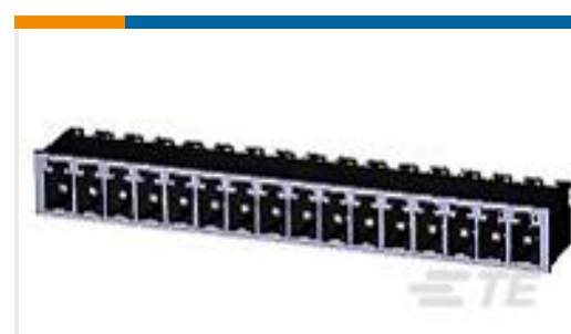
TE Part #284517-2 2P TERMIBLOK HDR DIR POLAR