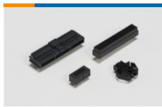
PCB Connector Shrouds(39)