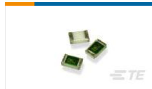
TE Part #2-1614884-4 CPF 0805 20R 0.1% 25PPM 1K RL