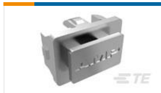
TE Part #1367147-1 SFP COVER, UNPLATED