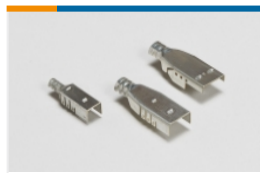
PCB Ferrules &amp; Shields(19)