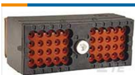
TE Part #DRC16-40S PLG, 40P, BLK, N