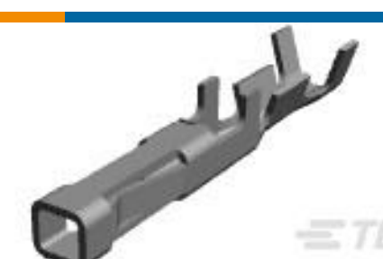
TE Part #1-794607-1 MICRO MNL RPT CNT STRP 15AU LF