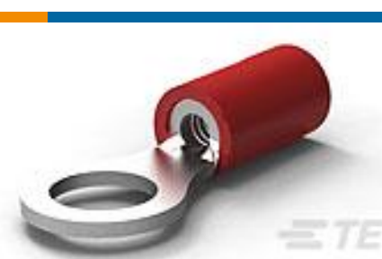
TE Part #130014 TERM, R, PG, 22-16, M5