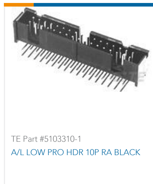
TE Part #5103310-1 A/L LOW PRO HDR 10P RA BLACK