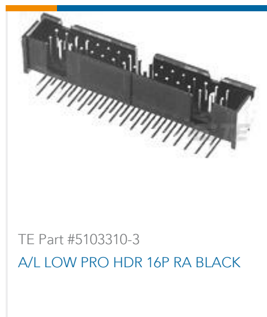
TE Part #5103310-3 A/L LOW PRO HDR 16P RA BLACK