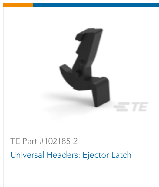
TE Part #102185-2 Universal Headers: Ejector Latch