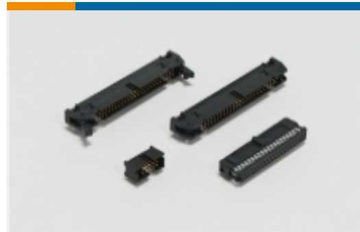
Ribbon Cable Connectors(525)