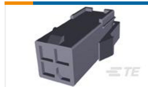
TE Part #794939-1 04P MINI UMNL CAP HSG