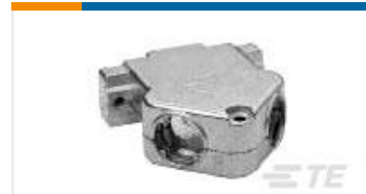
TE Part #1534811-1 HD20 COVER KIT37POS WITH CABLE CLAMPS