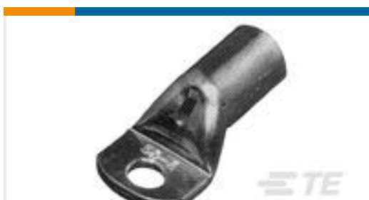
TE Part #710026-5 XCT 25-8