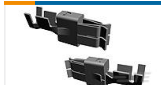
TE Part #963709-1 SPT REC 6.3 Contact SRC Sn