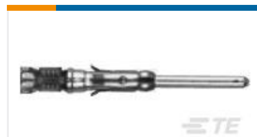
TE Part #4-1105000-3 HD.M-C-STI.SN.1,5