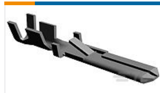
TE Part #928794-2 FF 110 TAB PTP CUZN30