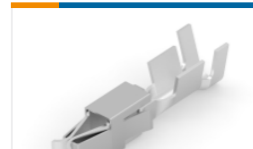
TE Part #927777-1 JUNIOR POWER TIMER CONTACT