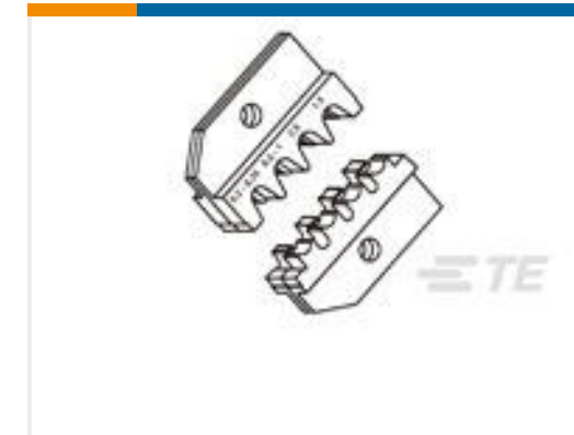
TE Part #539743-2 DIE F2.8FF TAB