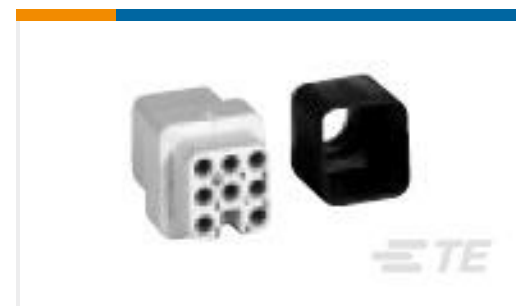
TE Part #2-1103101-3 HN.D.7.BU.C. 250 V