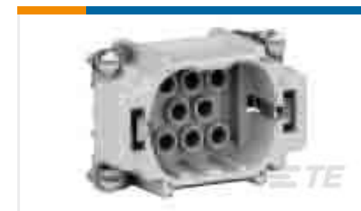
TE Part #2-1104000-3 HVT.8.STI.C