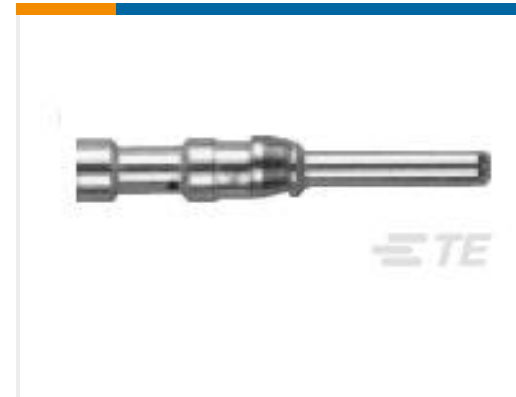
TE Part #3-1105300-1 HVT-C-Sti.Ag.1,5 qmm