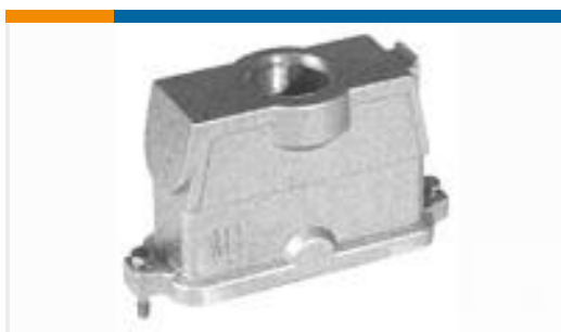
TE Part #1108534-1 HIP-K1640STO.2.21G