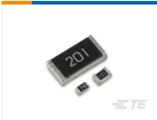
TE Part #5-2176330-5 CRGP 2010 330K 1%