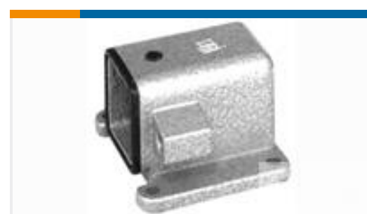
TE Part #4-1102702-5 EMV-K.3/4.SGF