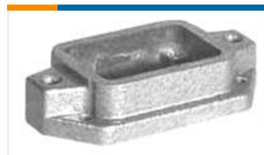
TE Part #2-1102647-5 HIP-K.10/24.AG