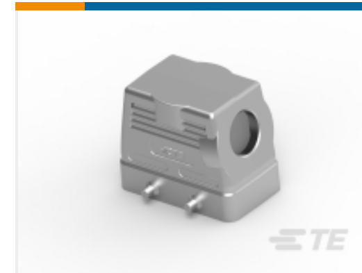
TE Part #T1210101116-000 H10B-TS-PG16