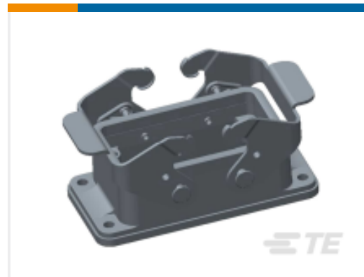
TE Part #T1410102000-100 H10B-AG