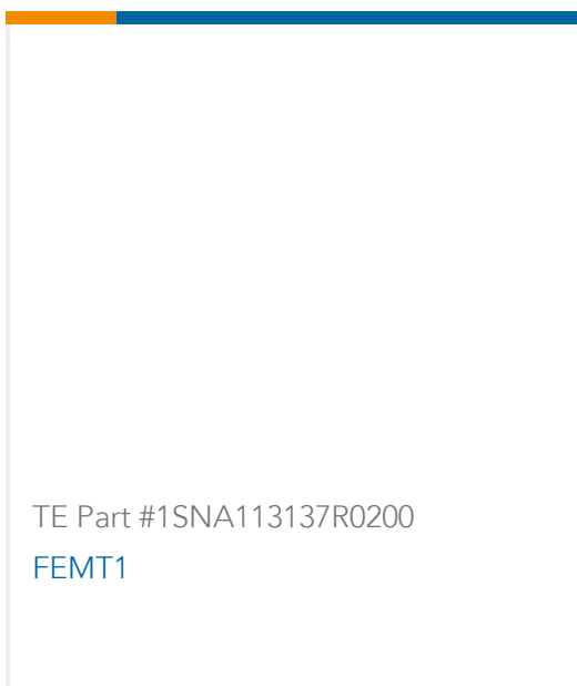
TE Part #1SNA113137R0200 FEMT1