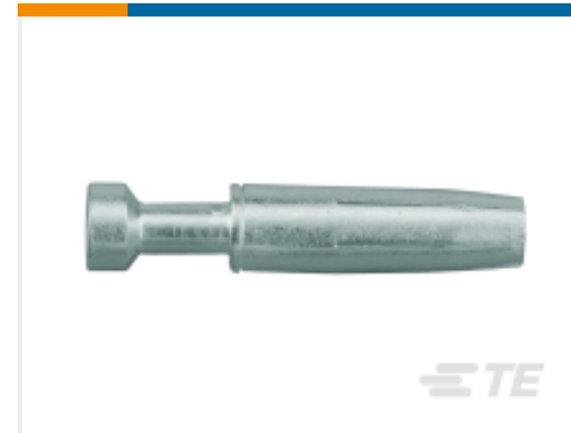
TE Part #T2030002008-000 CEF-0.75