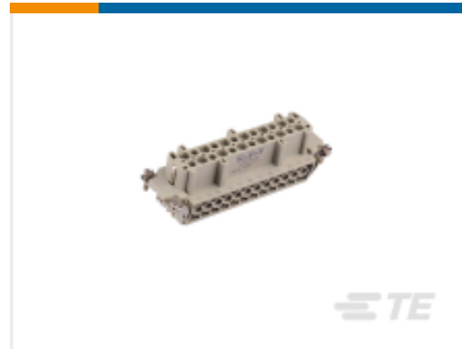
TE Part #T2040482201-000 HE-024-F 25-48