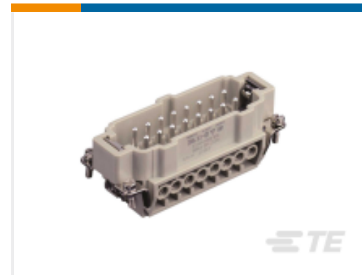
TE Part #T2040322101-000 HE-016-M 17-32