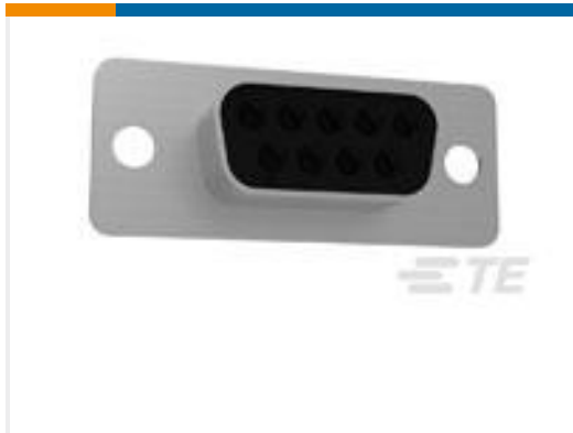
TE Part #164533-4 25P.HDP20 REC.ASSY.