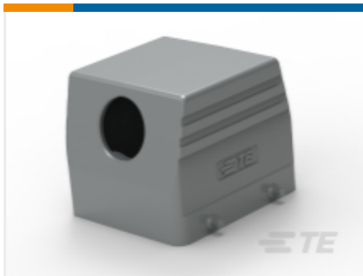
TE Part #T1210320136-000 H32B-TS-PG36