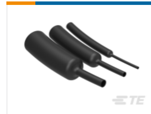
TE Part #2286896001 RNF-3000-R-1.5/0.5-0