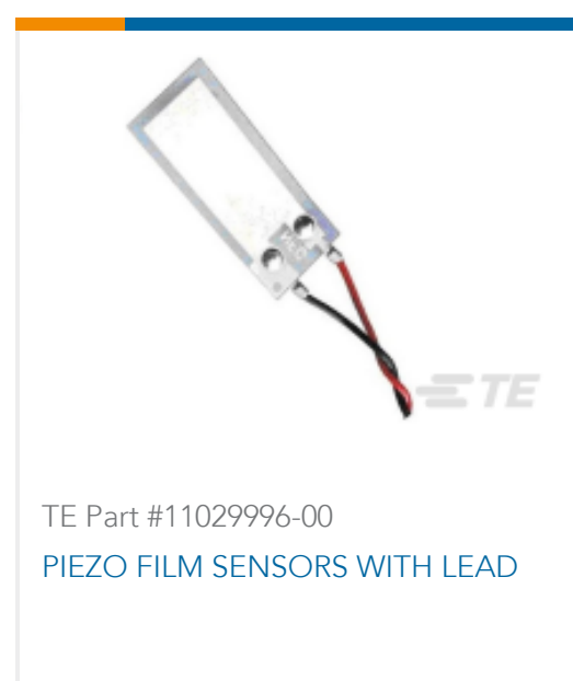
TE Part #11029996-00 PIEZO FILM SENSORS WITH LEAD