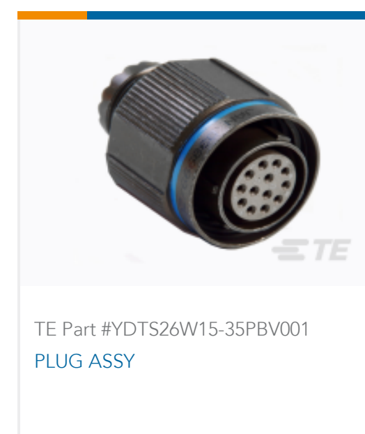
TE Part #YDTS26W15-35PBV001 PLUG ASSY