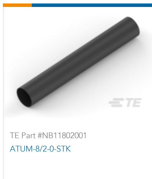
TE Part #NB11802001 ATUM-8/2-0-STK