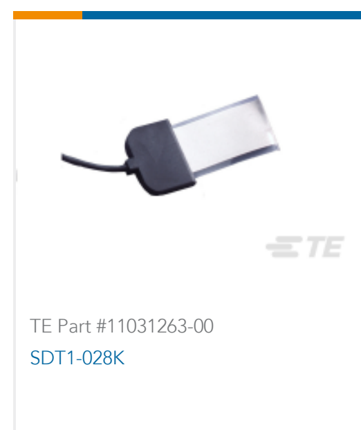
TE Part #11031263-00 SDT1-028K