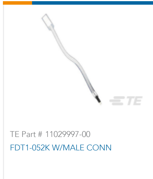
TE Part # 11029997-00 FDT1-052K W/MALE CONN