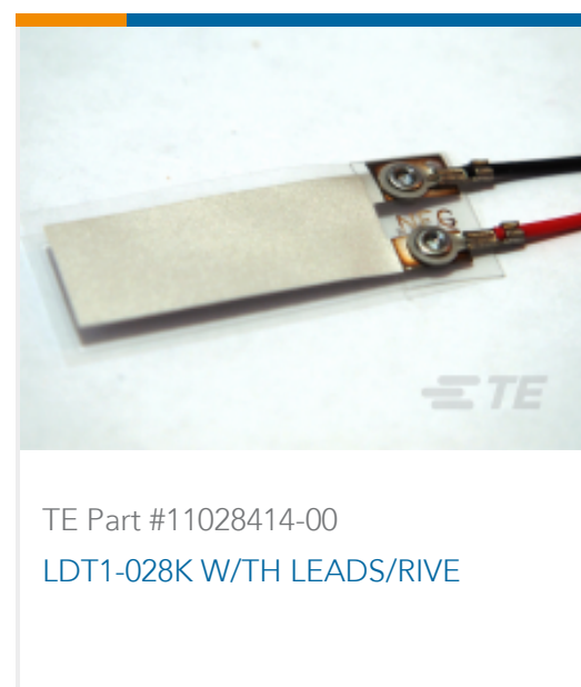
TE Part #11028414-00 LDT1-028K W/TH LEADS/RIVE