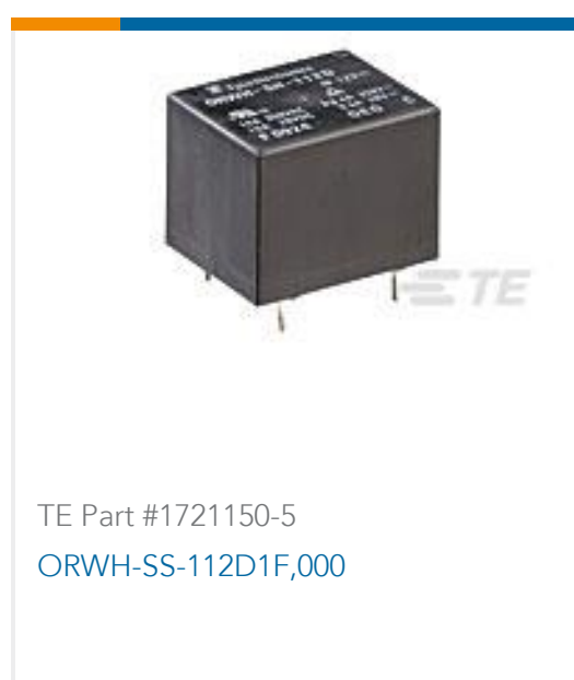
TE Part #1721150-5 ORWH-SS-112D1F,000