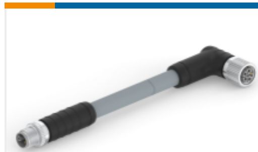
TE Part #T41526B9L25-002 RPC-M12L-5MS-1.0-5FR-PUR 14AWG GY