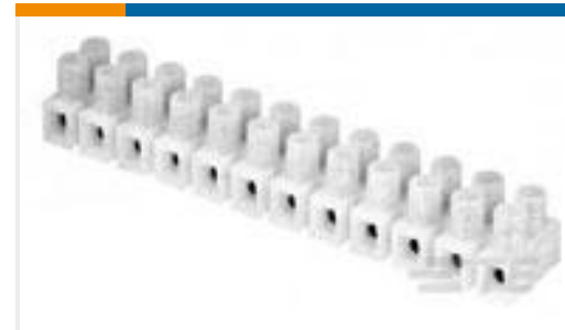
TE Part #1-1776293-2 TSB23012DS=EUROPA TERM BLK, 8MM