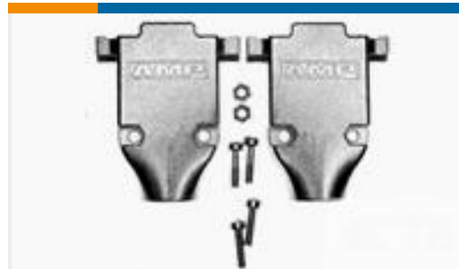
TE Part #5748676-5 DIE CAST CBL CLMP KIT,SZ 5