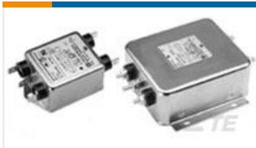
TE Part #6609043-1 3VV1=F7250 S0