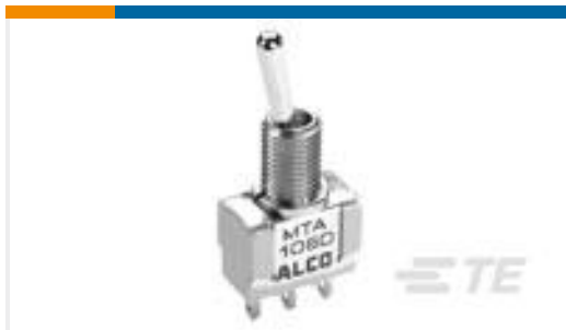
TE Part #1-1437558-4 MTA106F=(MSTA) SW TOG SPDT