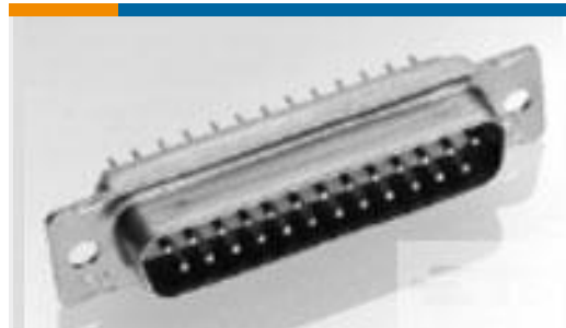
TE Part #1-1757820-0 AMPLIMITE,ASY,RCPT,STD,109,ZN,5, CT