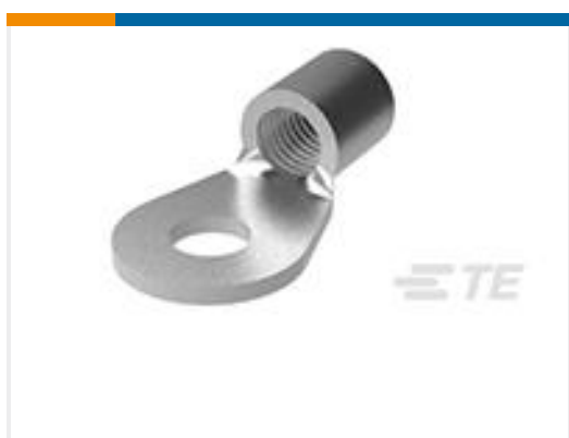
TE Part #52197-1 TERM, RING, SOLIS, 6, #10, T&R