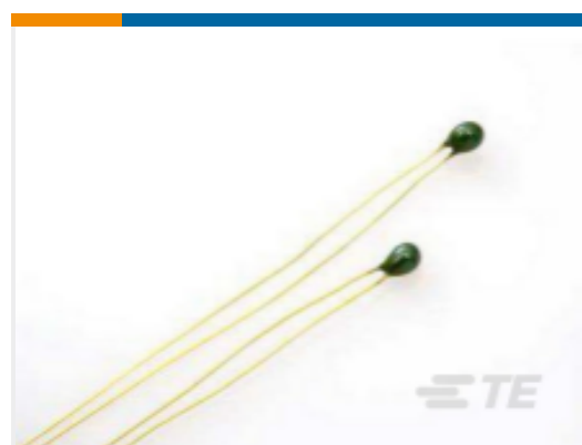
TE Part #11026436-00 55016 GEM THERM