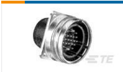
TE Part #1776088-1 CMC RECEPT ASSY, SIZE 28-16