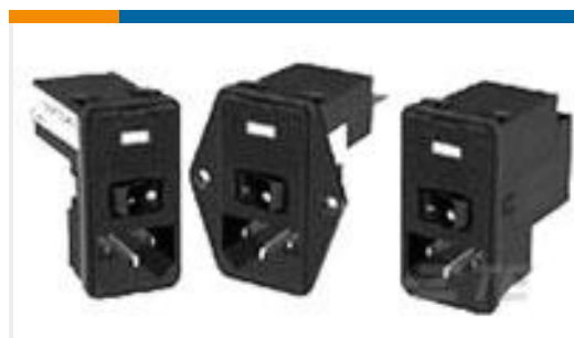
TE Part #6609101-2 PS000D000=C1002