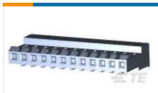
TE Part #4-640428-2 12P MTA156 CONN ASSY 22AWG RED