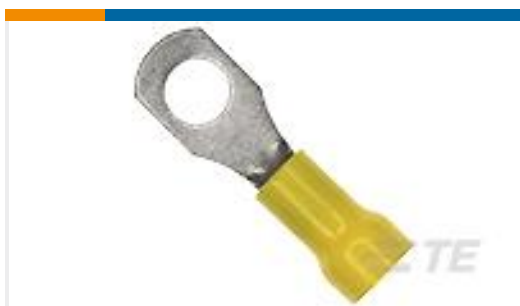
TE Part #55678-2 TERM, PG RING 12-10 1/4