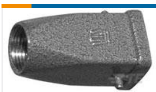
TE Part #1106405-1 HA.3.STO.1.M16.G