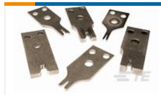
TE Part #1-456405-5 CRIMPER, WIRE .080 "F"