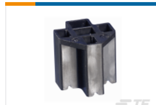
TE Part #1-1904045-1 V23333Z0001A007-EV-100