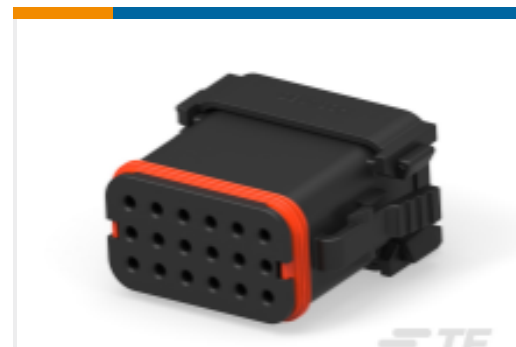
TE Part #DT16-18SA-K004 PLG, 18P, BLK, E, A