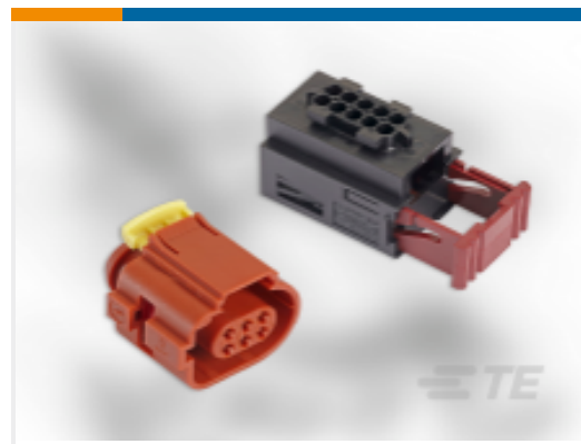
TE Part #1-967242-1 Timer Connector Housing