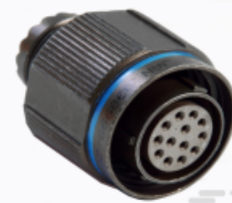
TE Part #YDTS26W17-35PNV001 PLUG ASSY