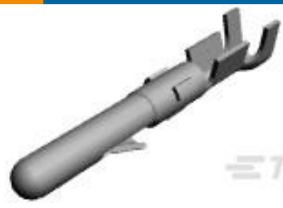
TE Part #60620-1 CMNL PIN 20-14 TPBR L/P