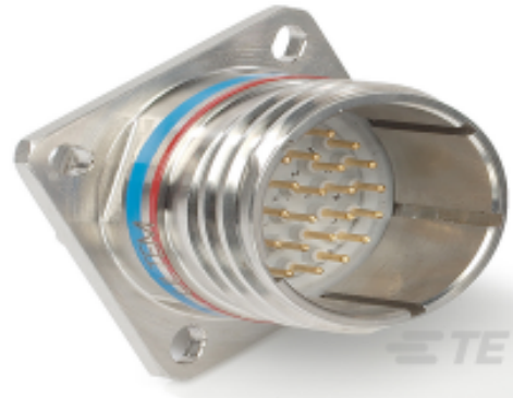
TE Part #YDTS20F17-35PNV001 RECP ASSY