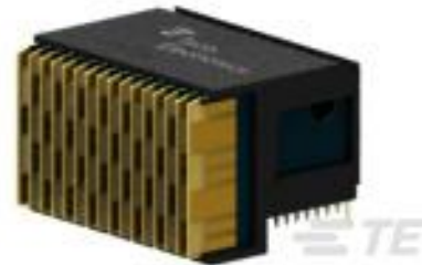
TE Part #2102771-1 DC, 7Row, Center, MULTIGIG RT 2R