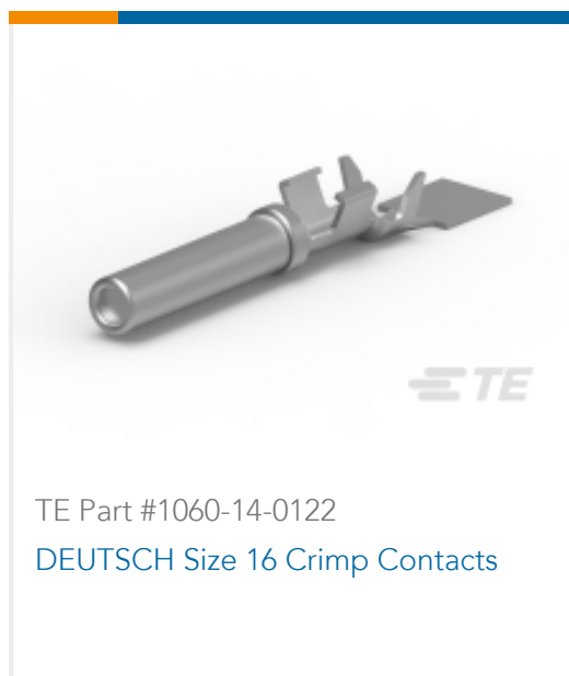
TE Part #1060-14-0122 DEUTSCH Size 16 Crimp Contacts