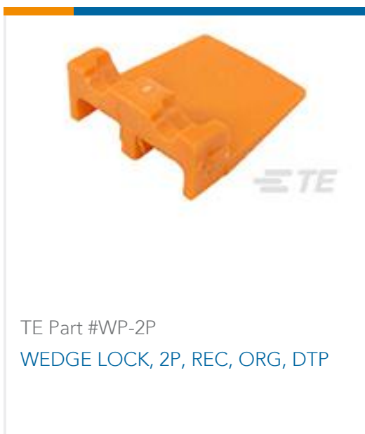
TE Part #WP-2P WEDGE LOCK, 2P, REC, ORG, DTP