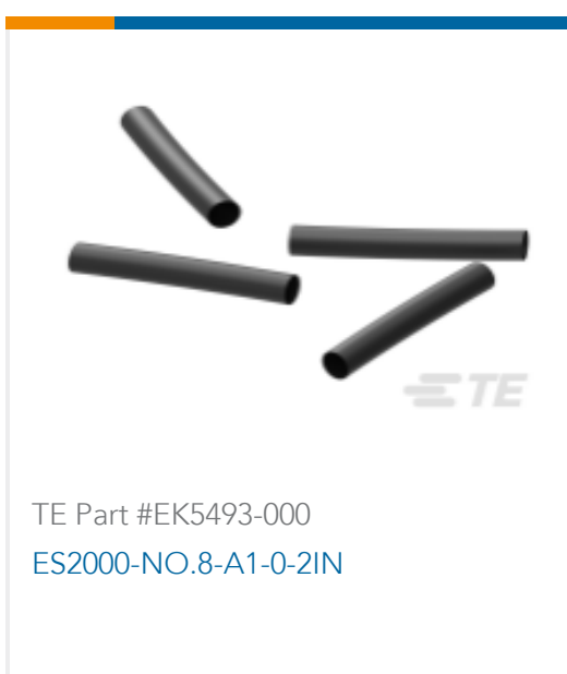
TE Part #EK5493-000 ES2000-NO.8-A1-0-2IN