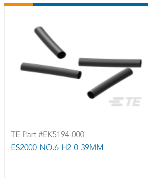
TE Part #EK5194-000 ES2000-NO.6-H2-0-39MM