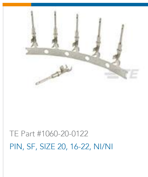
TE Part #1060-20-0122 PIN, SF, SIZE 20, 16-22, NI/NI