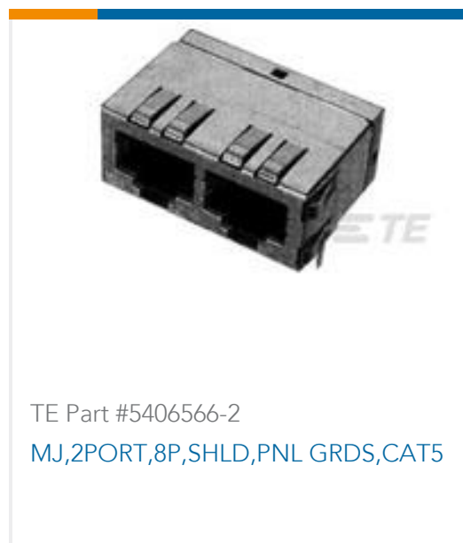
TE Part #5406566-2 MJ,2PORT,8P,SHLD,PNL GRDS,CAT5