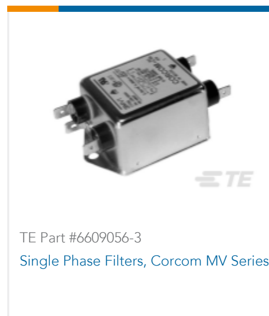
TE Part #6609056-3 Single Phase Filters, Corcom MV Series