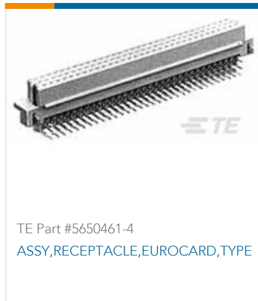
TE Part #5650461-4 ASSY,RECEPTACLE,EUROCARD,TYPE