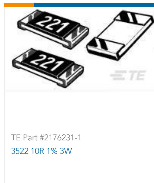
TE Part #2176231-1 3522 10R 1% 3W