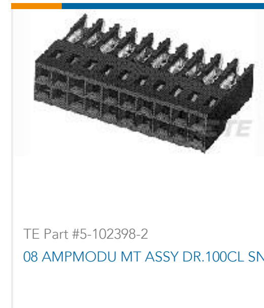
TE Part #5-102398-2 08 AMPMODU MT ASSY DR.100CL SN