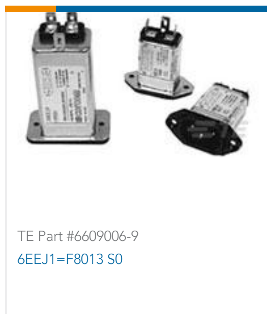
TE Part #6609006-9 6EEJ1=F8013 S0