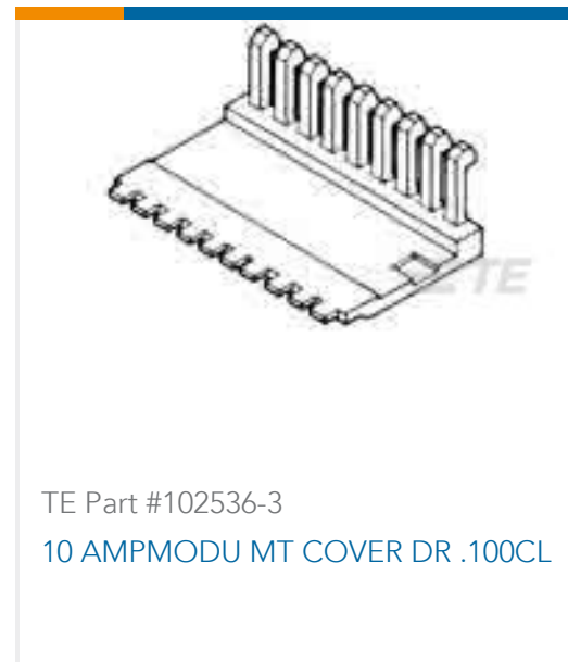
TE Part #102536-3 10 AMPMODU MT COVER DR .100CL