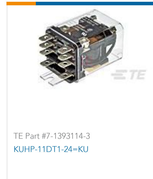
TE Part #7-1393114-3 KUHP-11DT1-24=KU