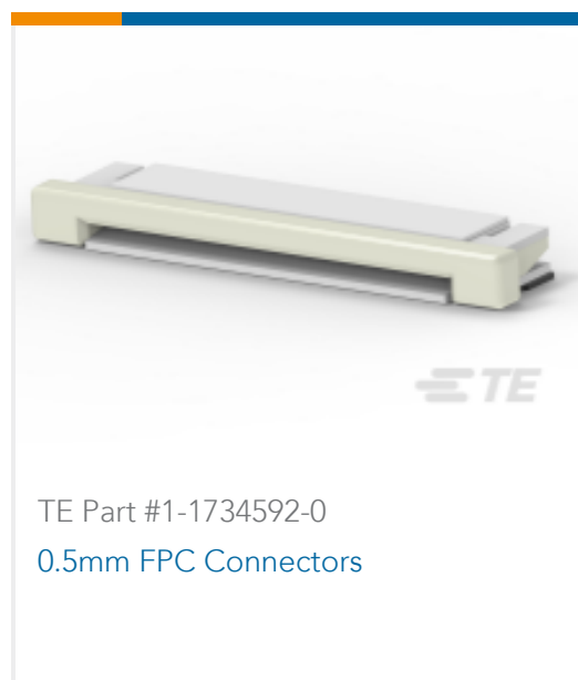
TE Part #1-1734592-0 0.5mm FPC Connectors