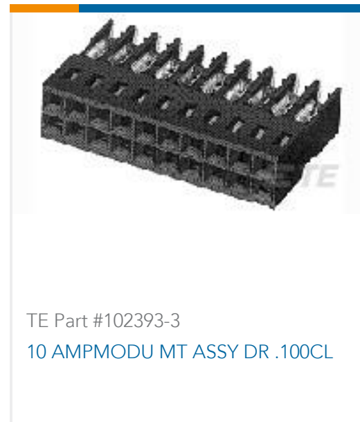
TE Part #102393-3 10 AMPMODU MT ASSY DR .100CL