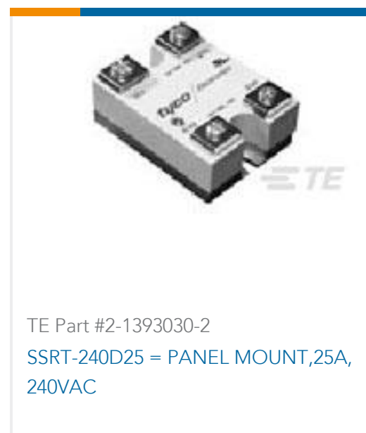
TE Part #2-1393030-2 SSRT-240D25 = PANEL MOUNT, 25A, 240VAC