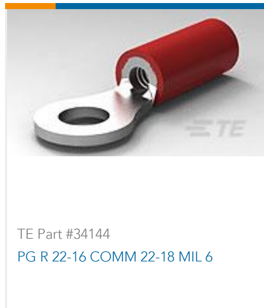
TE Part #34144 PG R 22-16 COMM 22-18 MIL 6