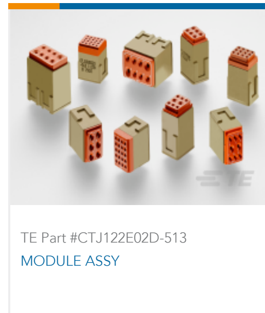
TE Part #CTJ122E02D-513 MODULE ASSY