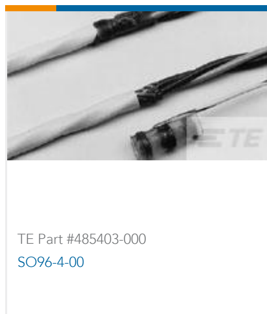
TE Part #485403-000 SO96-4-00