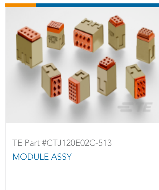
TE Part #CTJ120E02C-513 MODULE ASSY