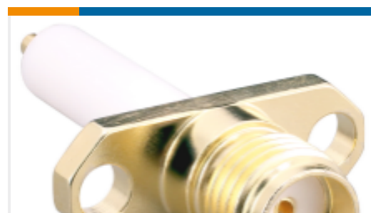
TE Part #CON SMA018-15-G SMA Jack 50 Ohm Panel Mount