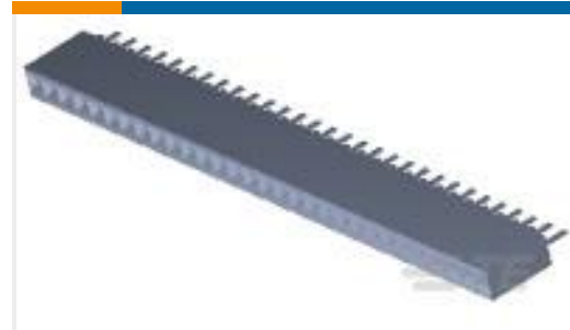
TE Part #2-535541-8 30 MODIV VRT SR CE 100/115