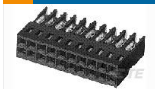
TE Part #102398-4 12 AMPMODU MT ASSY DR .100CL