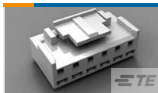
TE Part #1-1123722-6 3.96 EP PLUG HSG 6P(NATURAL)