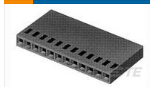
TE Part #5-87499-8 30 MODIV HSG COMP SR .100CL