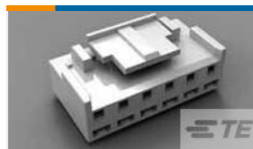
TE Part #1-1123722-4 3.96 EP PLUG HSG 4P(NATURAL)