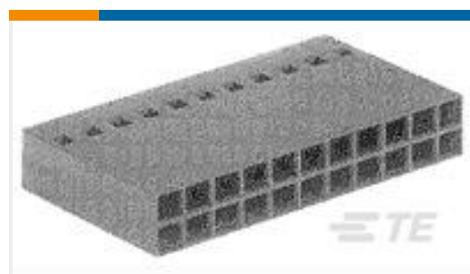
TE Part #1-104482-8 40 SHORT PT RCPT HSG DR .100CL