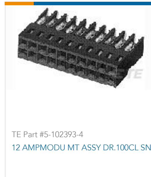
TE Part #5-102393-4 12 AMPMODU MT ASSY DR.100CL SN