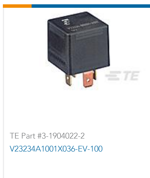
TE Part #3-1904022-2 V23234A1001X036-EV-100