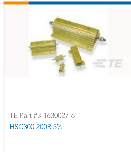
TE Part #3-1630027-6 HSC300 200R 5%