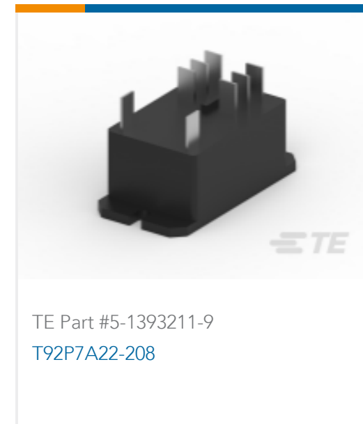
TE Part #5-1393211-9 T92P7A22-208