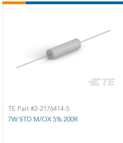
TE Part #2-2176414-5 7W STD M/OX 5% 200R