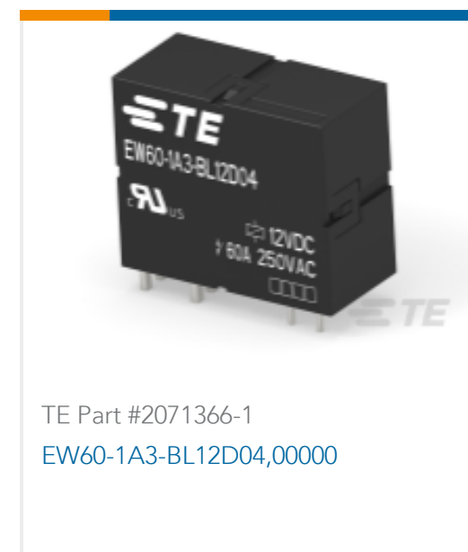
TE Part #2071366-1 EW60-1A3-BL12D04,00000