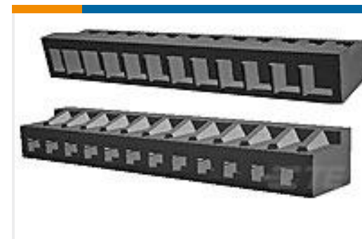
TE Part #172520-6 6P 2.5MM MINI AMP-IN HDR HSG