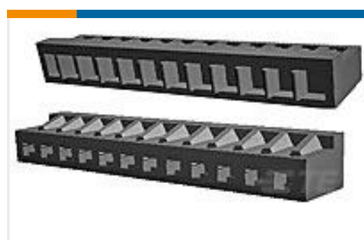
TE Part #172520-4 LOW PRO MINI AMP-IN HDR 4P