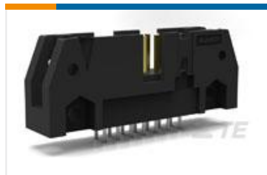
TE Part #5102153-6 A/L UNIV HDR 26P VERT