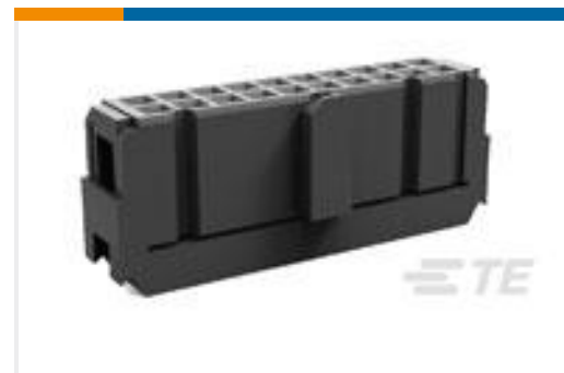
TE Part #1658621-3 16 NOVO MIL/CTR 15DP, LEAD FREE