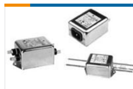
TE Part #6609036-7 6VSK7=F7240 S0