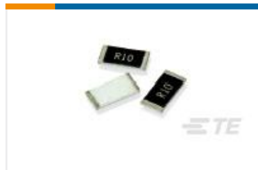
TE Part #3-2176055-5 RLP73K 2B R27 1% 1K RL