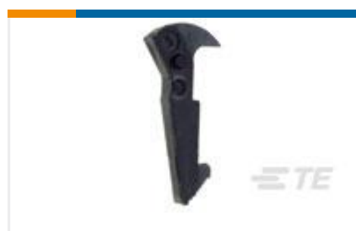
TE Part #102320-1 UNIVERSAL HEADER LATCH