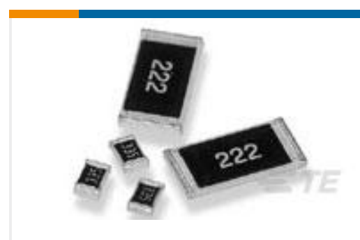
TE Part #3-1879494-3 CRGH0603 5% 22R 0.2W