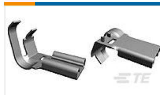
TE Part #180430-2 250 FASTON,FLAG,REC.,20-16 AWG, TPBR