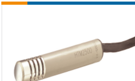
TE Part #HPP809A033 HTM2500LFL HIGH TEMP RH/T MOD