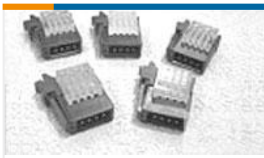
TE Part #4-1473562-3 RITS CONN. PLUG ASSY 3P GREEN