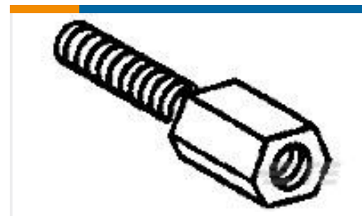
TE Part #828102-1 HD-20SCHRAUB-SICHRG