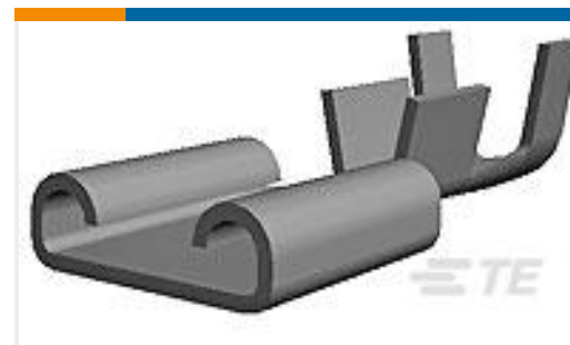
TE Part #2-160256-1 250 FASTON,REC.,17-14 AWG,BR