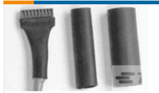
TE Part #2951512003 DWP-125-1/4-0-STK