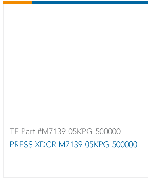
TE Part #M7139-05KPG-500000 PRESS XDCR M7139-05KPG-500000