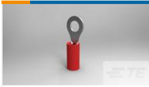
TE Part #320551 PIDG R 22-16 COMM 22-18 MIL 8