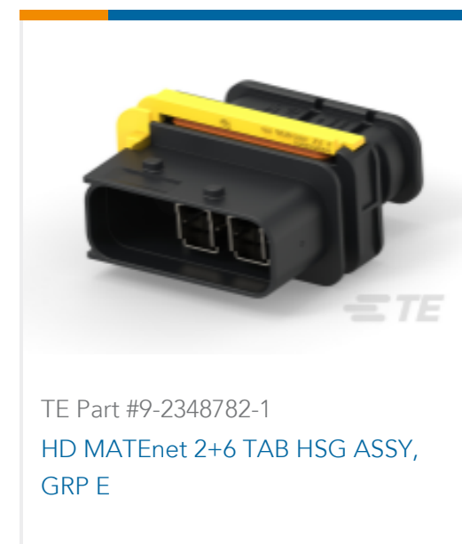
TE Part #9-2348782-1 HD MATEnet 2+6 TAB HSG ASSY, GRP E