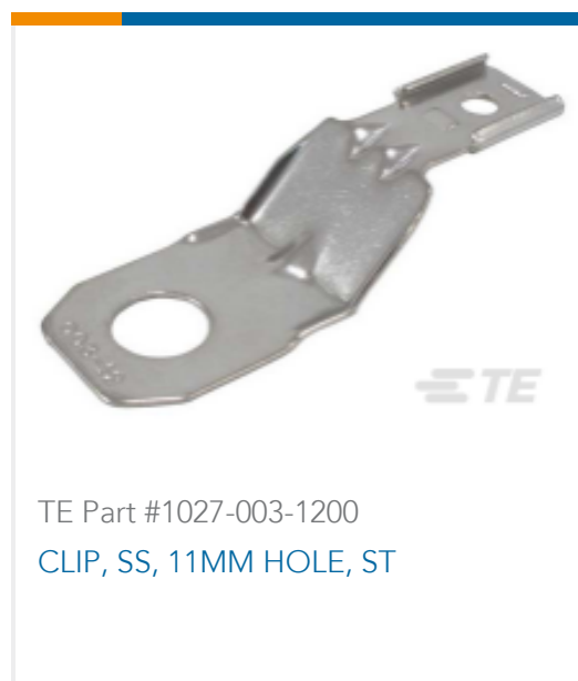
TE Part #1027-003-1200 CLIP, SS, 11MM HOLE, ST