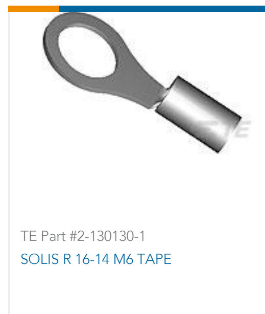
TE Part #2-130130-1 SOLIS R 16-14 M6 TAPE