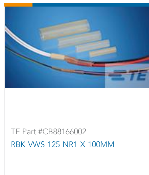
TE Part #CB88166002 RBK-VWS-125-NR1-X-100MM