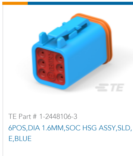
TE Part # 1-2448106-3 6POS,DIA 1.6MM,SOC HSG ASSY,SLD, E,BLUE