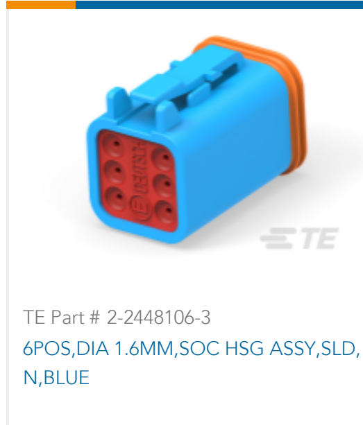
TE Part # 2-2448106-3 6POS,DIA 1.6MM,SOC HSG ASSY,SLD, N,BLUE