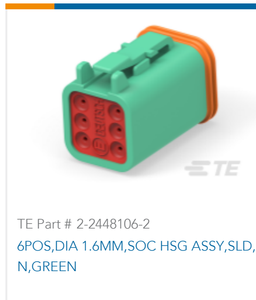
TE Part # 2-2448106-2 6POS,DIA 1.6MM,SOC HSG ASSY,SLD, N,GREEN