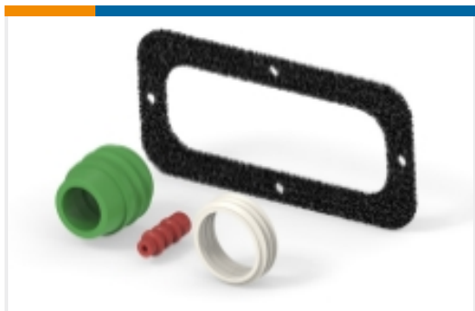
Connector Seals & Cavity Plugs (6)