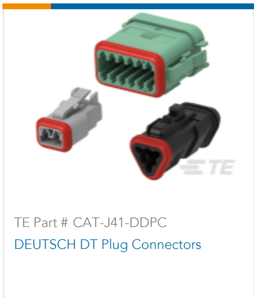
TE Part # CAT-J41-DDPC DEUTSCH DT Plug Connectors