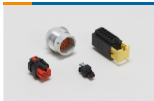
Automotive Housings (620)