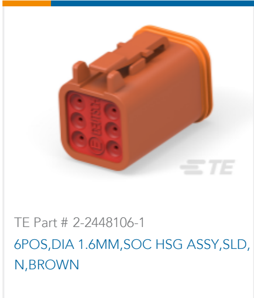
TE Part # 2-2448106-1 6POS,DIA 1.6MM,SOC HSG ASSY,SLD, N,BROWN