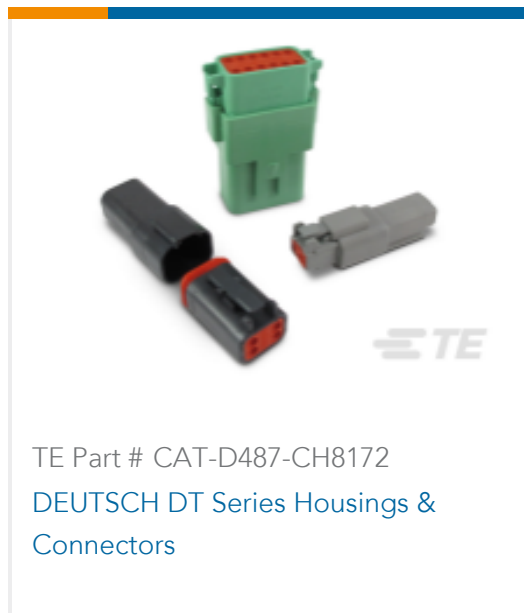
TE Part # CAT-D487-CH8172 DEUTSCH DT Series Housings & Connectors