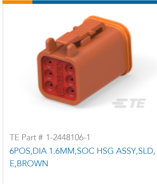
TE Part # 1-2448106-1 6POS,DIA 1.6MM,SOC HSG ASSY,SLD, E,BROWN