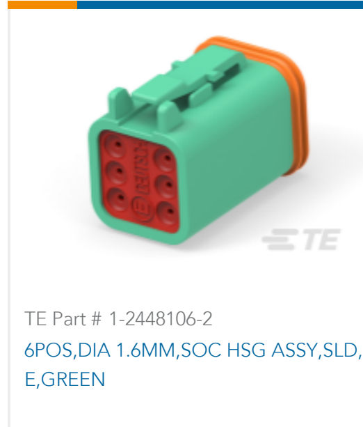
TE Part # 1-2448106-2 6POS,DIA 1.6MM,SOC HSG ASSY,SLD, E,GREEN