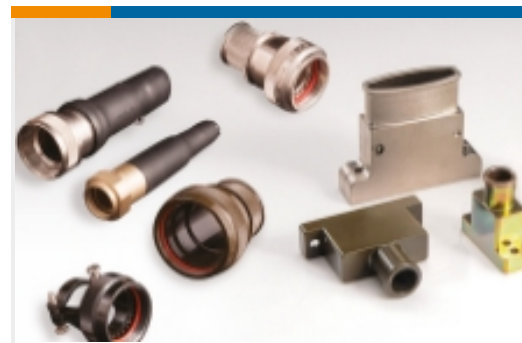
Connector Backshells (58)