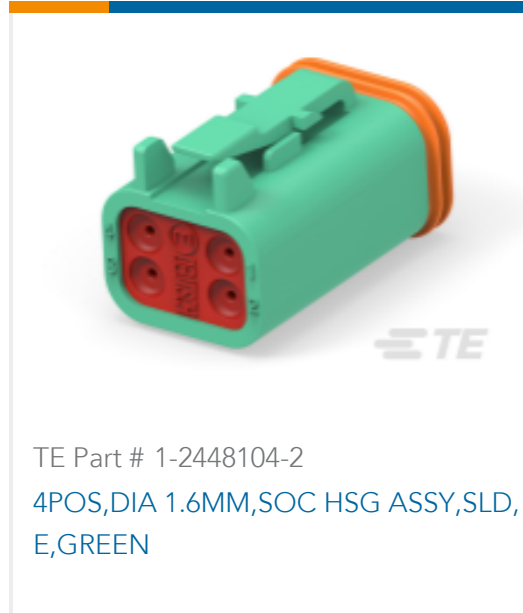
TE Part # 1-2448104-2 4POS,DIA 1.6MM,SOC HSG ASSY,SLD, E,GREEN