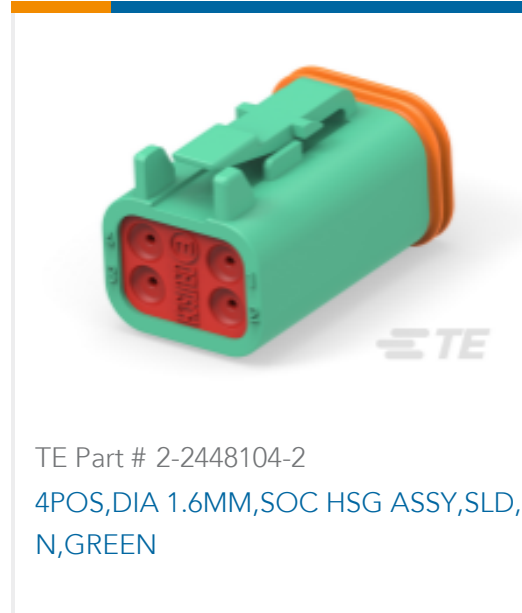
TE Part # 2-2448104-2 4POS,DIA 1.6MM,SOC HSG ASSY,SLD, N,GREEN