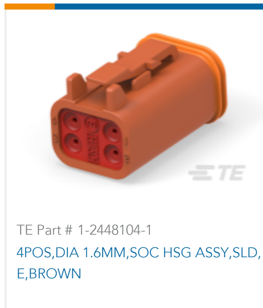
TE Part # 1-2448104-1 4POS,DIA 1.6MM,SOC HSG ASSY,SLD, E,BROWN