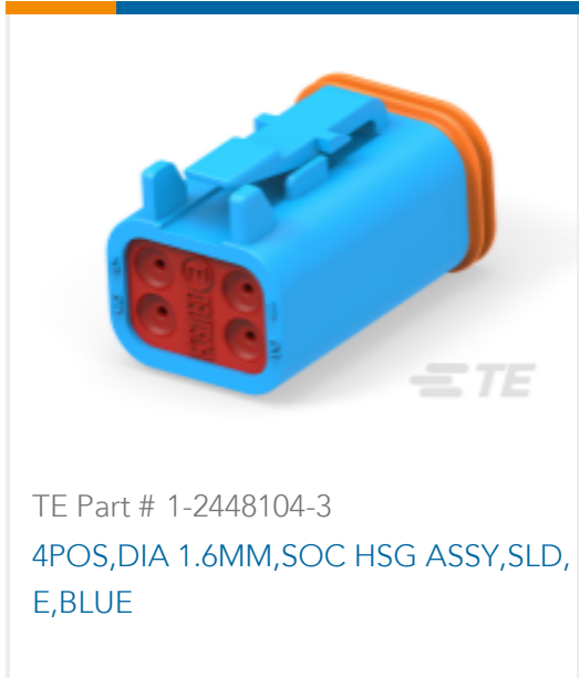
TE Part # 1-2448104-3 4POS,DIA 1.6MM,SOC HSG ASSY,SLD, E,BLUE