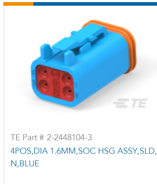
TE Part # 2-2448104-3 4POS,DIA 1.6MM,SOC HSG ASSY,SLD, N,BLUE