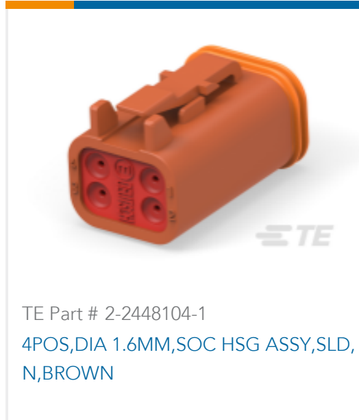
TE Part # 2-2448104-1 4POS,DIA 1.6MM,SOC HSG ASSY,SLD, N,BROWN