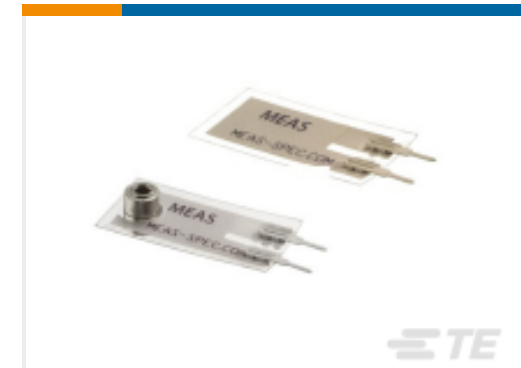
TE Part #11028362-00 LDT0-028K W/SOLDER TAB CLEAR