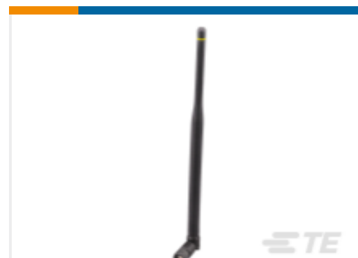
TE Part #ANT-916-OC-LG-SMA Antenna Whip Coil 916MHz Swivel SMA