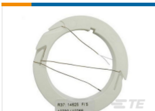
TE Part #GAG22K7MCD419 GLS9-MCD +/-15% 37°C 0.38MM