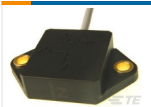
TE Part #4030-006-120 6G TRIAXIAL MEMS DC ACCELEROMETER