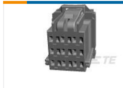
TE Part #6-968971-1 MCP2.8 GEH ASSY 9P