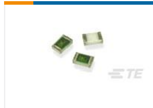
TE Part #1-2176094-7 RP 2A 0.25W 174K 0.1% 25PPM 1K RL