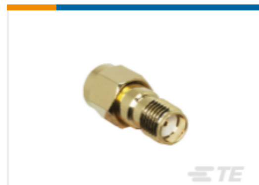
TE Part #ADP-RPSM-SMAF-G RP-SMA Plug to SMA Jack