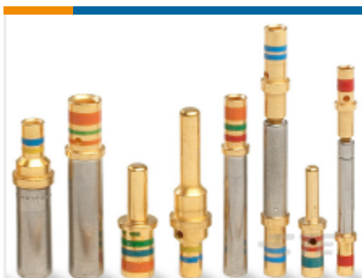
TE Part # 0641-1-2031L CONT PIN