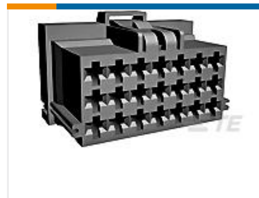
TE Part #7-968975-1 MCP2,8 GEH ASSY 21P