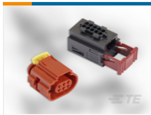
TE Part #1-967625-5 Timer Connector Housing