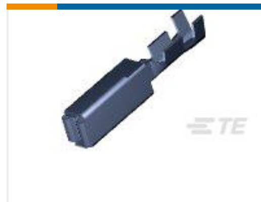
TE Part #1-1355876-1 AMP MCP 2.8, CONTACT LANCELESS