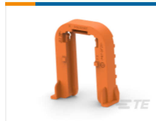
TE Part #2317070-1 SLIDE,PIN HSG ASSY