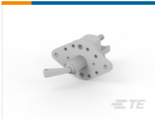
TE Part #K1143392 Battery Disconnecter 35-411-120-R