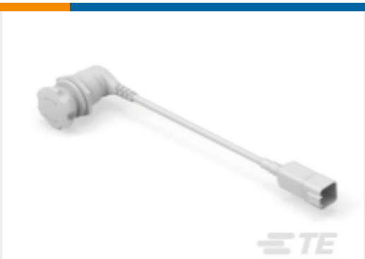
TE Part #K1163730 Emergency switch ES-2003-T412-020C