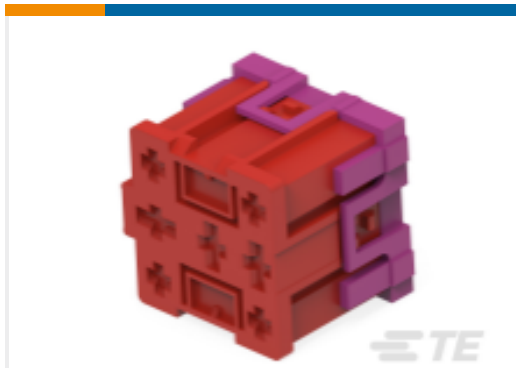
TE Part #444313-3 HSG ASS'Y 9 POSN. COMB.