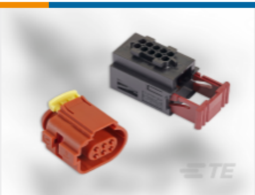
TE Part #1-967625-5 Timer Connector Housing