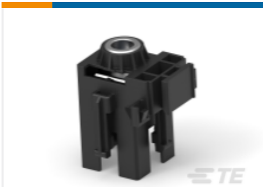
TE Part #444309-1 HSG ASS'Y POWER/GRO