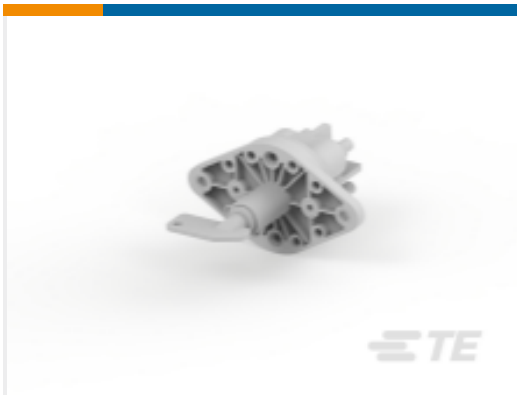
TE Part #K1126751 Battery Disconnecter 35-220-000-R