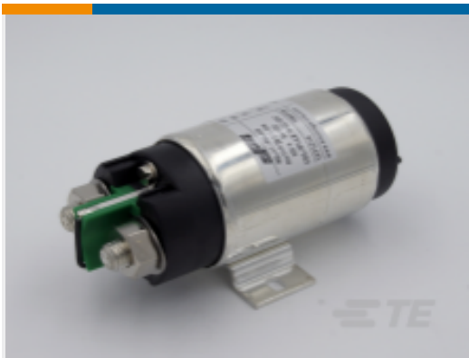
TE Part #K1060611 Relay 29-311-12A