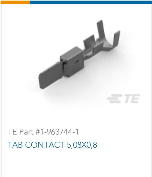
TE Part #1-963744-1 TAB CONTACT 5,08X0,8