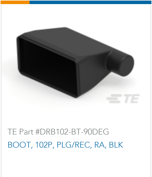
TE Part #DRB102-BT-90DEG BOOT, 102P, PLG/REC, RA, BLK