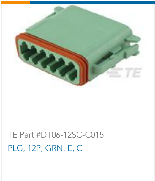
TE Part #DT06-12SC-C015 PLG, 12P, GRN, E, C