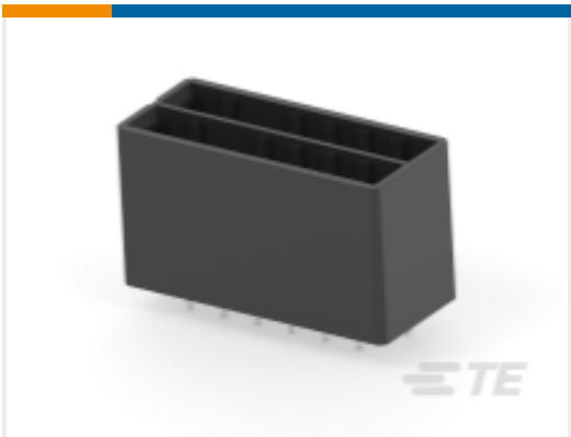
TE Part #1-178140-5 Header Assembly: Wire-to-Board, 15A, gold or tin plated