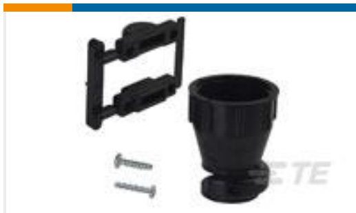
TE Part #206070-8 CABLE CLAMP KIT #17