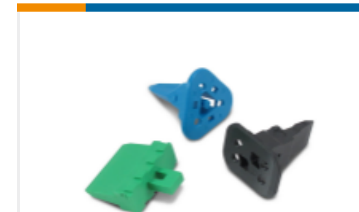
TE Part #W2S Wedgelocks: DEUTSCH DT