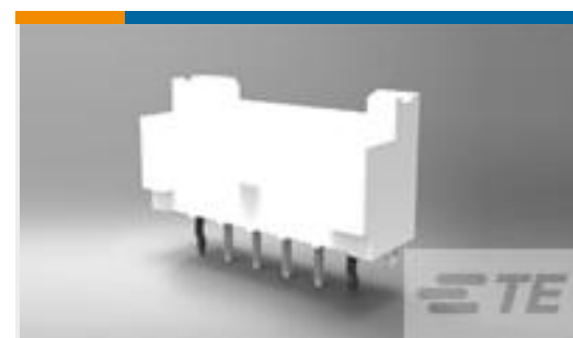
TE Part #1-2132415-0 EP2.5 Shrouded HDR ASSY 10P VERT w/oboss