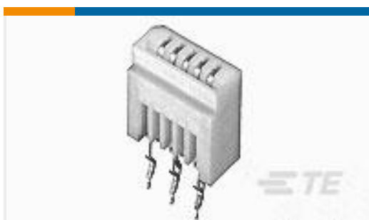
TE Part #1-84984-4 1mm FFC DIP V ASSY 14P TUBE