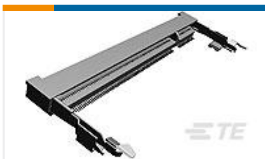
TE Part #1-1473005-1 SEMI HARD TRAY DDR SOCKET 200P