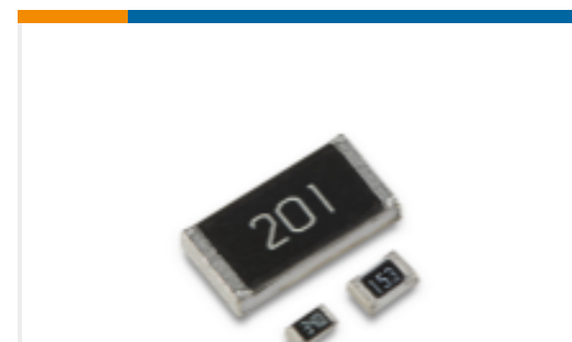
TE Part #1-2176326-7 CRGP 0603 220R 1%