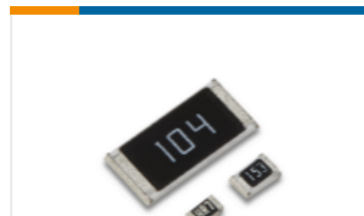
TE Part #3-2176345-4 CRGCQ 1210 5K6 1%