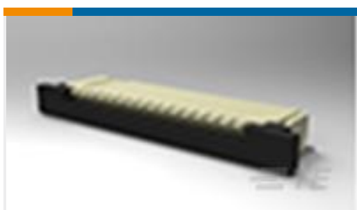
TE Part # 1-84953-5 1MM FPC HORZ.TOP CONT.ASSY 15P