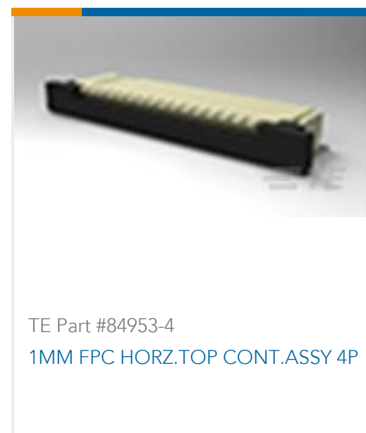
TE Part #84953-4 1MM FPC HORZ.TOP CONT.ASSY 4P