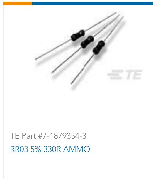
TE Part #7-1879354-3 RR03 5% 330R AMMO