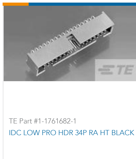
TE Part #1-1761682-1 IDC LOW PRO HDR 34P RA HT BLACK