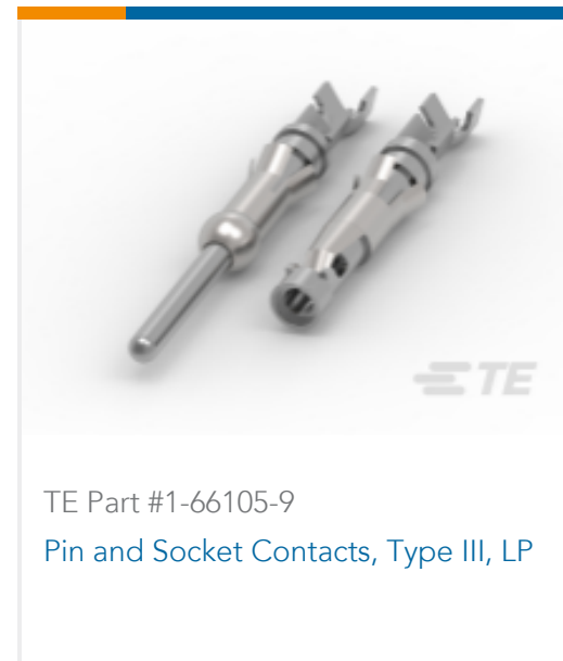
TE Part #1-66105-9 Pin and Socket Contacts, Type III, LP