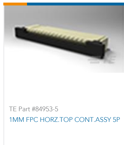
TE Part #84953-5 1MM FPC HORZ.TOP CONT.ASSY 5P