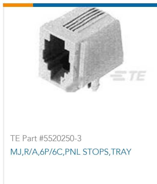
TE Part #5520250-3 MJ,R/A,6P/6C,PNL STOPS,TRAY