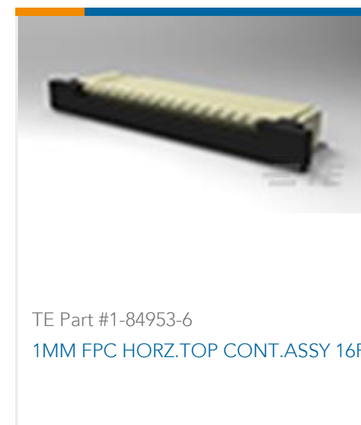
TE Part #1-84953-6 1MM FPC HORZ.TOP CONT.ASSY 16P