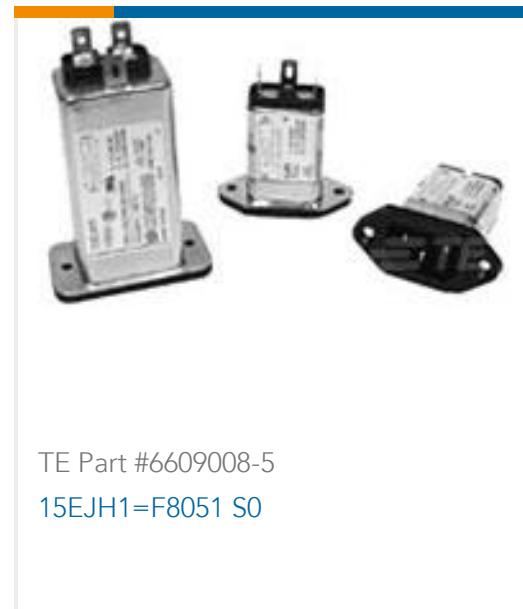
TE Part #6609008-5 15EJH1=F8051 S0