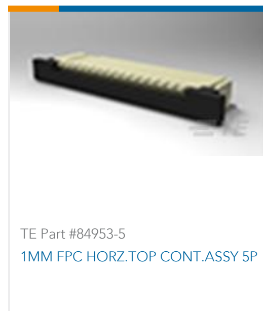
TE Part #84953-5 1MM FPC HORZ.TOP CONT.ASSY 5P