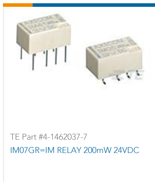
TE Part #4-1462037-7 IM07GR=IM RELAY 200mW 24VDC