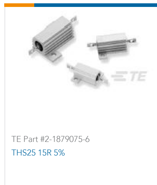
TE Part #2-1879075-6 THS25 15R 5%