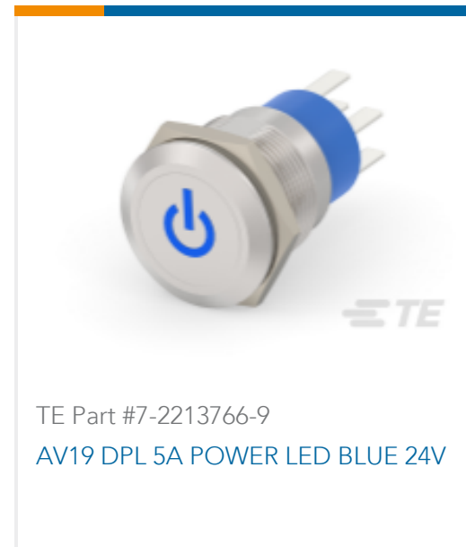
TE Part #7-2213766-9 AV19 DPL 5A POWER LED BLUE 24V