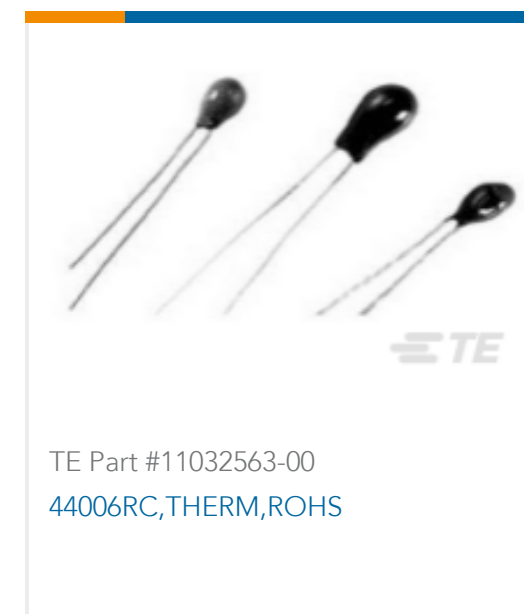
TE Part #11032563-00 44006RC,THERM,ROHS