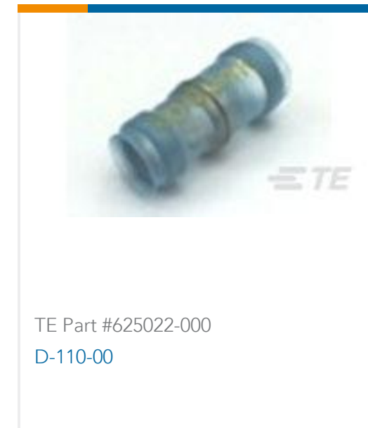
TE Part #625022-000 D-110-00