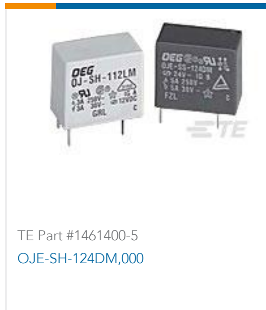
TE Part #1461400-5 OJE-SH-124DM,000