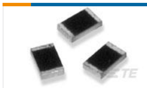
TE Part #1879808-1 RP 1J 1K0 0.1% 15PPM 5K RL