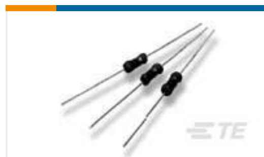
TE Part #4-1625890-5 2W SM M/OX 5% 39K