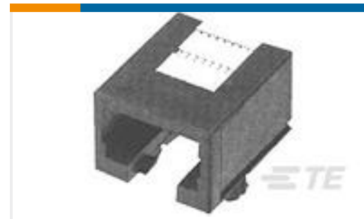
TE Part #215876-1 6/6 PCB MOD.JACK SE