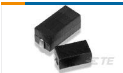
TE Part #2-1879234-7 SMF5 6K2 5%