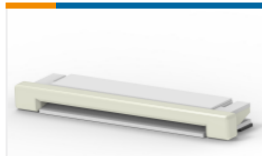
TE Part #4-1734592-0 0.5mm FPC Connectors