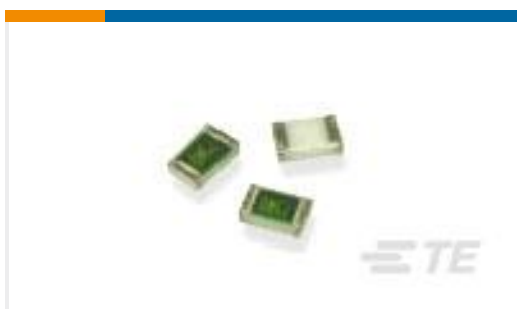
TE Part #1676341-2 RN 0805 43K2 0.1% 10PPM 1KRL