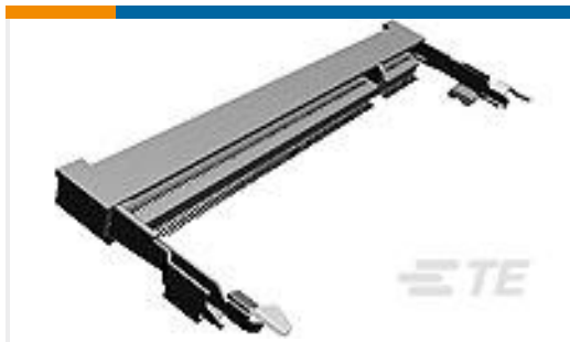
TE Part #1473005-4 SEMI-HARD TRAY DDR2 SODIMM SOCKET 200P 5