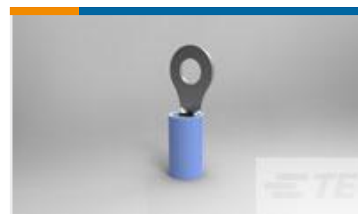
TE Part #51864-1 TERM, RT, PIDG, 16-14, #8