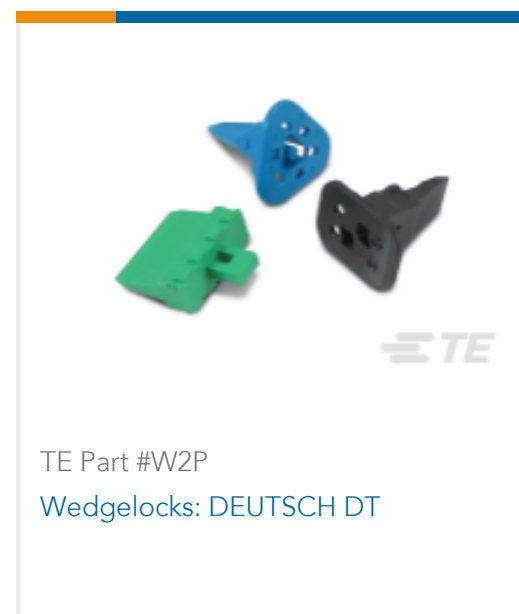
TE Part #W2P Wedgelocks: DEUTSCH DT