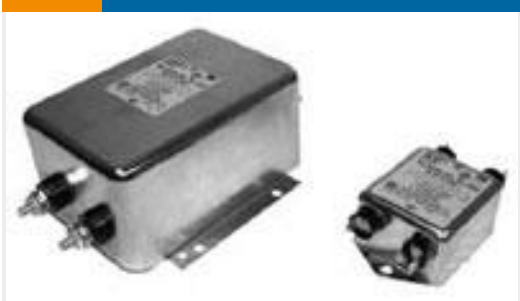
TE Part #1-6609037-8 3EMC3=F8146