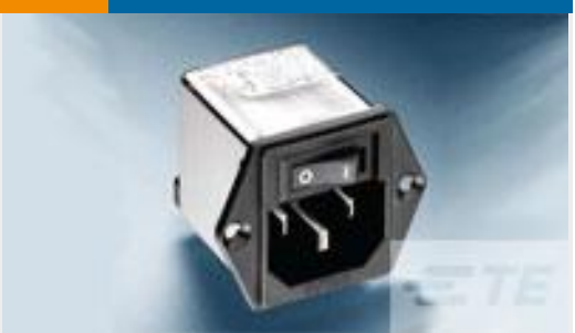
TE Part #2-1609113-3 3CUFE1=F8294