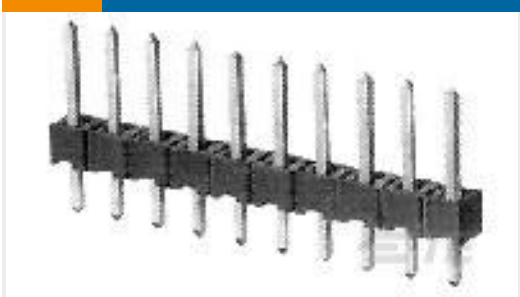
TE Part #3-826646-2 32P AMPMODU II STIFT LEI