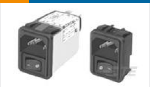
TE Part #1609112-3 10CE1 M0=F7804