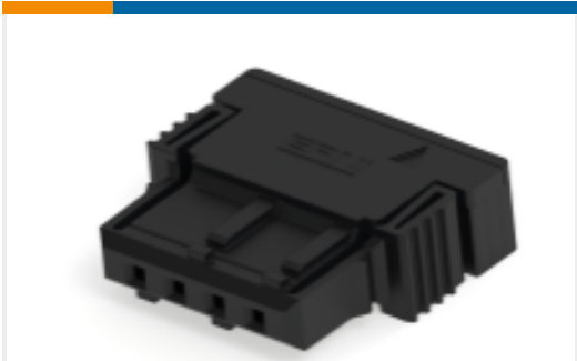
TE Part #384453-E SRCBUG A 2,54 2 4 CSI 112 E1 ADV J 2 324