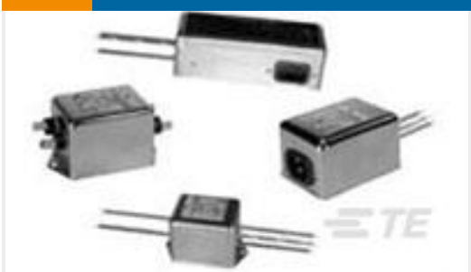
TE Part #6609048-6 6EQ3=F7263 S0