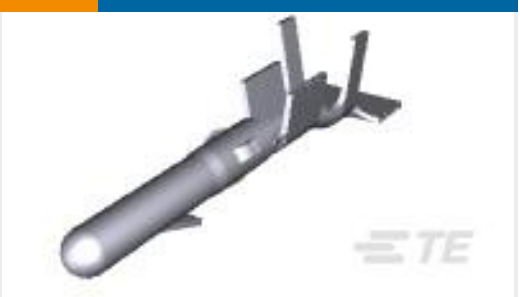
TE Part #350639-1 MNL PIN PTPBR