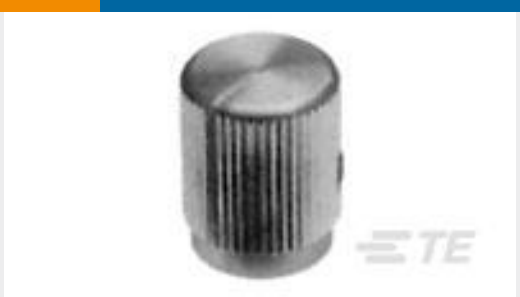
TE Part #9-1437621-4 KLN1250A1/4=KNOB KNURL W/IND L