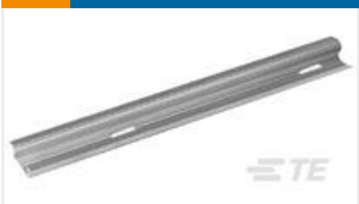
TE Part #1419111-6 24A110=TRACK,MOUNTING