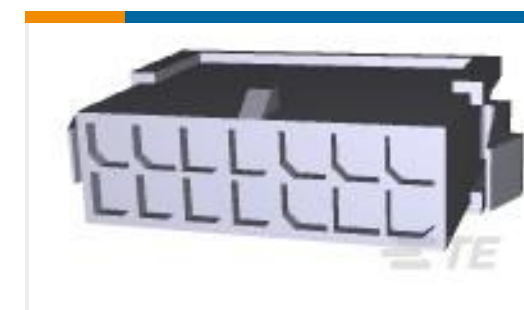
TE Part #1-794615-4 PANEL MT DBL ROW HSG 14 POS