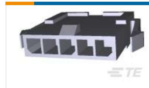
TE Part #1445048-5 PANEL MT SNGL ROW HSG 5 POS