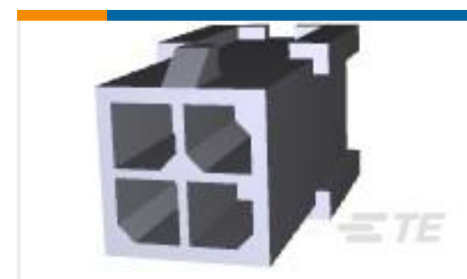
TE Part #794616-4 FREE HANG DBL ROW HSG 4 POS