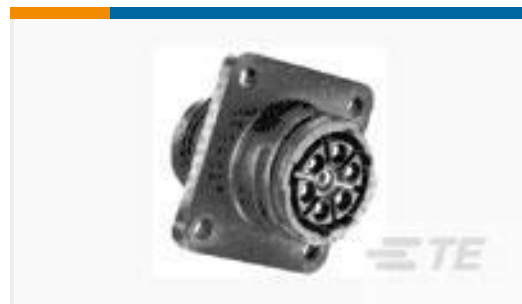
TE Part #211398-1 CPC RECPT. SIZE 13-7