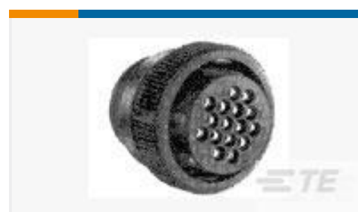
TE Part #206060-1 CPC PLUG ASSEMBLY SIZE 11-4