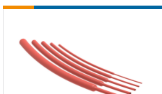
TE Part #NB20204001 VERSAFIT-1/8-2-SP