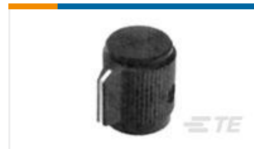
TE Part #9-1437622-7 KPN900A1/4=KNOB AL W/POINTER 1