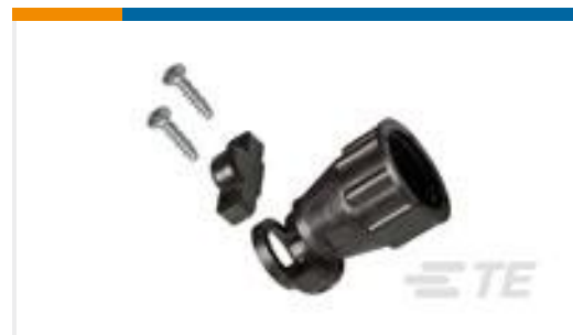
TE Part #1-206062-4 CABLE CLAMP KIT #11