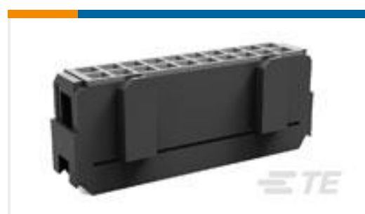
TE Part #1658624-9 40 NOVO DUAL 30DP, LEAD FREE