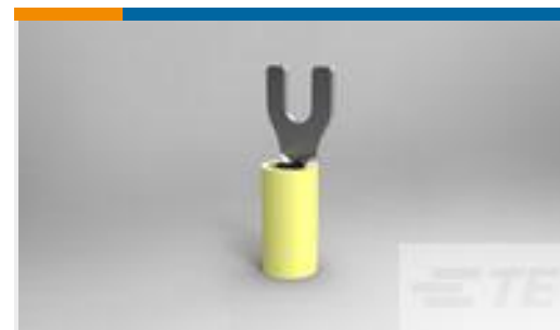
TE Part #8-35152-2 TERMINAL, PIDG SPD 12-10 8