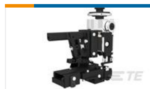
TE Part #2151546-1 OCEAN_2.0_APPLICATOR-S-110F