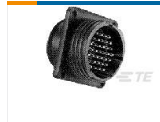
TE Part #206036-1 RECEPT,SZ 17-16 CPC