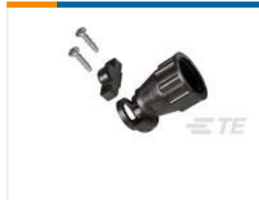
TE Part #1-206062-4 CABLE CLAMP KIT #11