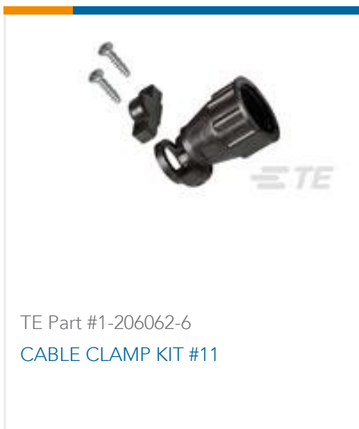
TE Part #1-206062-6 CABLE CLAMP KIT #11