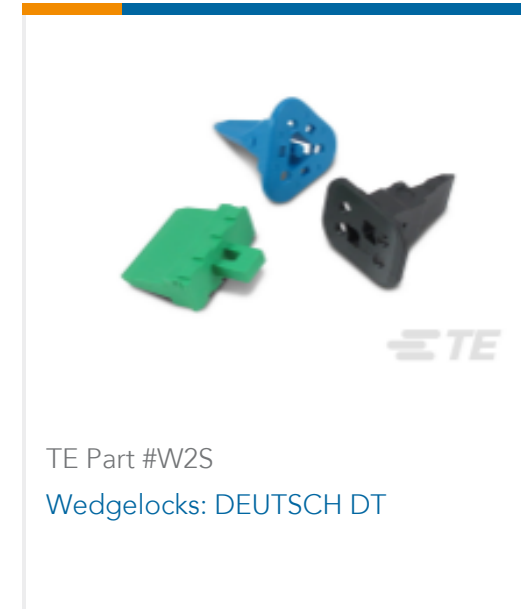
TE Part #W2S WedgeLocks: DEUTSCH DT