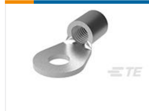
TE Part #321871 BODY SOLIS RING 2/0 3/8