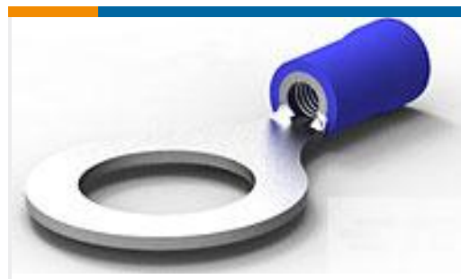
TE Part #160136 TERM, RING, PLASTI-GRIP, 16-14, M10