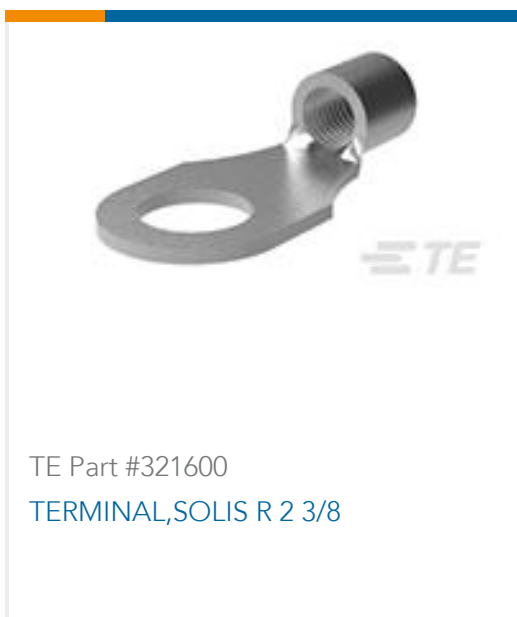
TE Part #321600 TERMINAL,SOLIS R 2 3/8