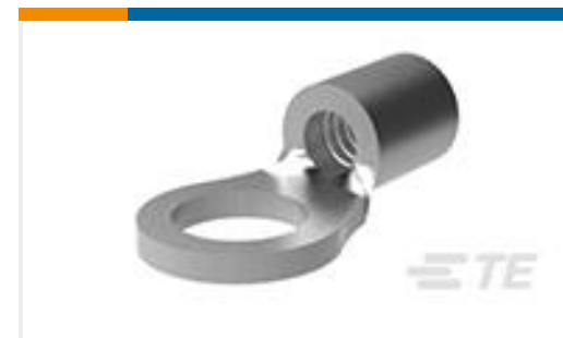
TE Part #8-33469-2 TERMINAL,SOLIS R 4 1/4