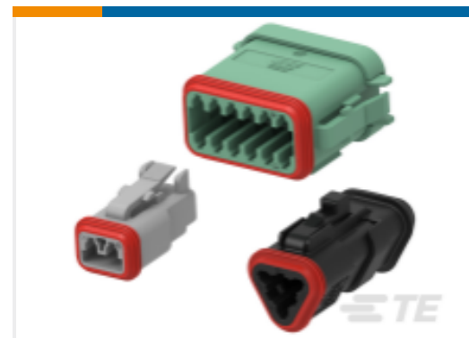
TE Part #DT06-4S-E005 DEUTSCH DT Plug Connectors