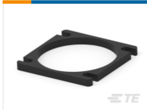
TE Part #HD10-9-GKT GASKET, 9SZ, BLK, HD10