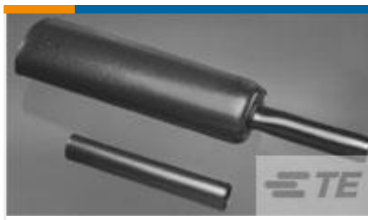
TE Part #420356-000 RMW-35/12-1200/ADH-0