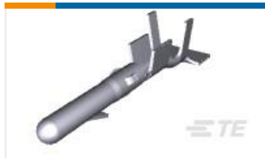
TE Part #350639-1 MNL PIN PTPBR