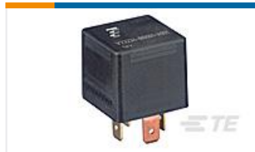
TE Part #2-1904025-6 V23234A0004X055-EV-100