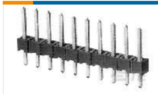
TE Part #3-826646-2 32P AMPMODU II STIFT LEI