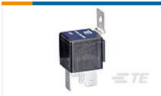
TE Part #9-1393303-7 V23134J0053D642-EV-CBOX