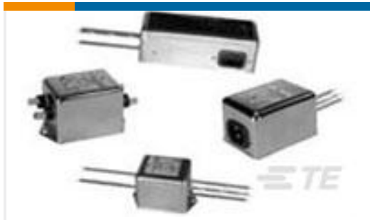
TE Part #6609048-5 6EQ1=F7262 S0