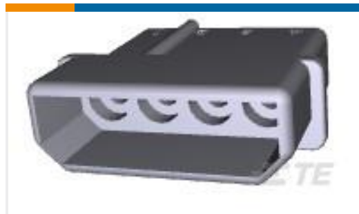
TE Part #1-480426-9 04P CMNL CAP HSG F/H BLK