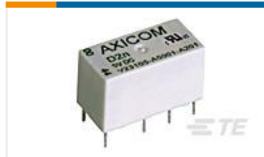
TE Part #1393793-9 V23105A5405A201