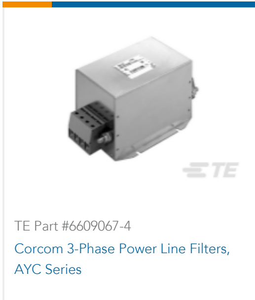
TE Part #6609067-4 Corcom 3-Phase Power Line Filters, AYC Series