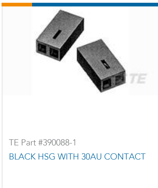
TE Part #390088-1 BLACK HSG WITH 30AU CONTACT