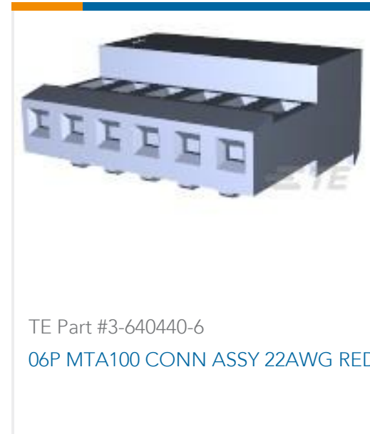
TE Part #3-640440-6 06P MTA100 CONN ASSY 22AWG RED