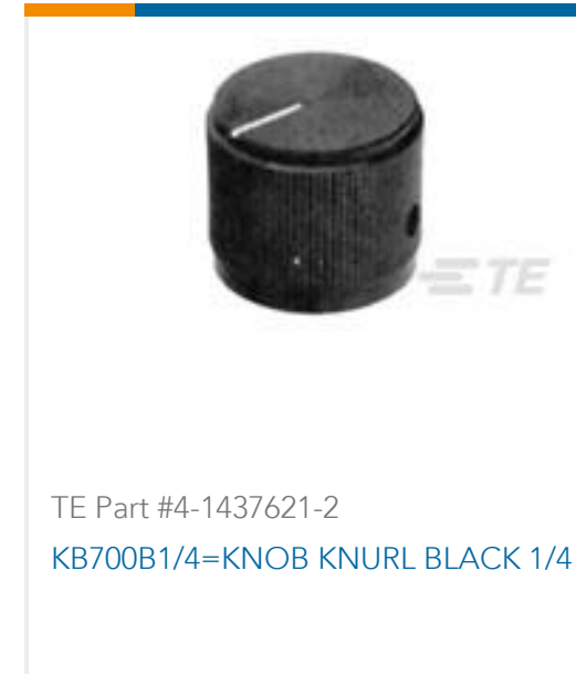
TE Part #4-1437621-2 KB700B1/4=KNOB KNURL BLACK 1/4