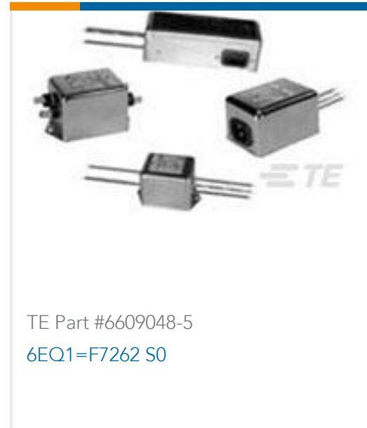
TE Part #6609048-5 6EQ1=F7262 S0