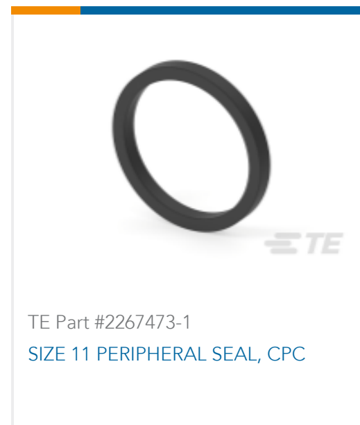
TE Part #2267473-1 SIZE 11 PERIPHERAL SEAL, CPC