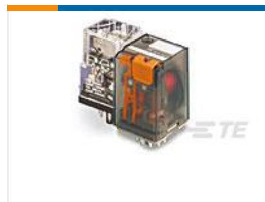
TE Part #1-1393105-2 KRPA-11AG-24=RELAY, GENPUR, OCTA