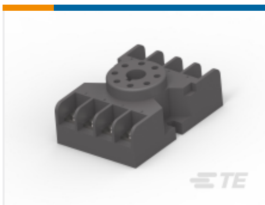
TE Part #1393143-6 27E122=SOCKET, KRP, 8, SCW, PLES