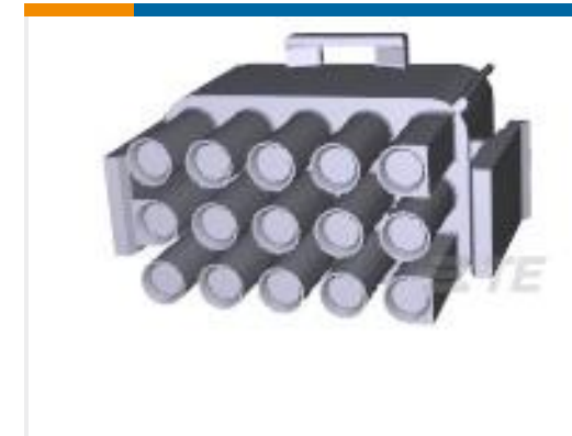
TE Part #350736-1 15P UMNL PLUG HSG