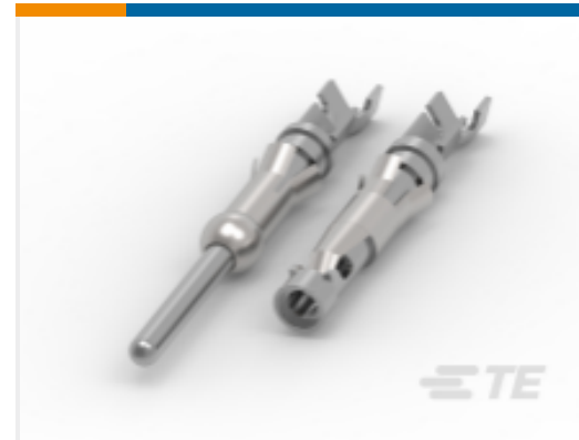
TE Part #66602-2 Pin and Socket Contacts, Type III, LP