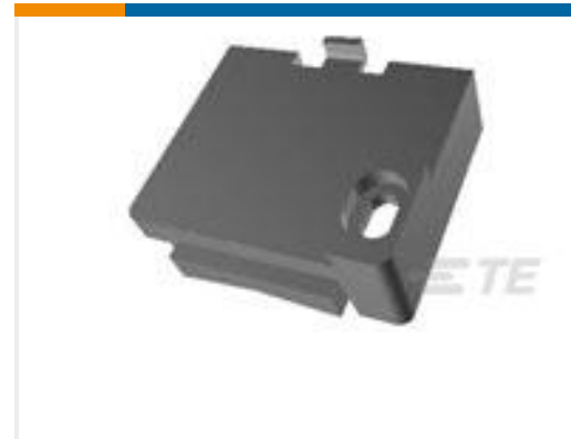
TE Part #1-640724-0 15P UMNL STR/REL & INSRT NATL