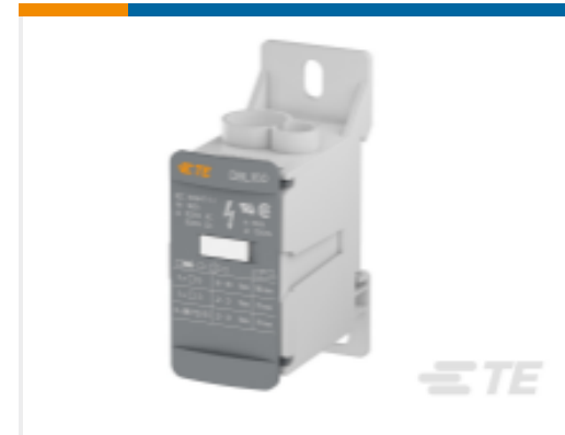
TE Part #1SNL316010R0000 DBL160