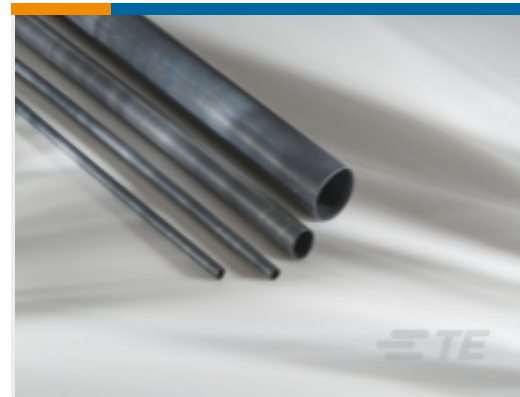
TE Part #EH2299-000 DWFR Heat shrink Tubing