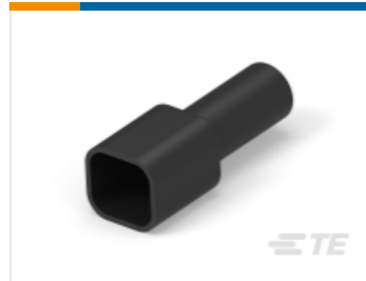
TE Part #DT6P-BT-BK BOOT, 6P, REC, ST, BLK