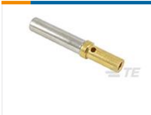
TE Part #0462-201-1631 SOC, SOLID, SIZE 16, 16-20AWG, AU